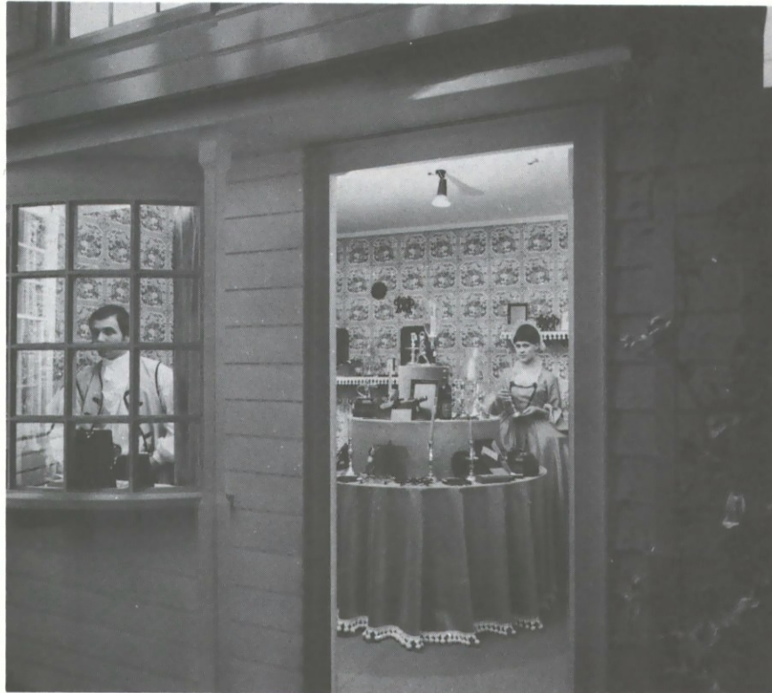
Costumed sales personnel at Harrods are shown above in one of several colonial-type shop facades which were designed for the display. Most of the merchandise shown here is from CW's Craft House.'

Harrods officials cited two purposes for the promotion. The first was a response to the 158 British merchandise promotions held in American stores last year. The second reason was to show British goods to American buyers in England.