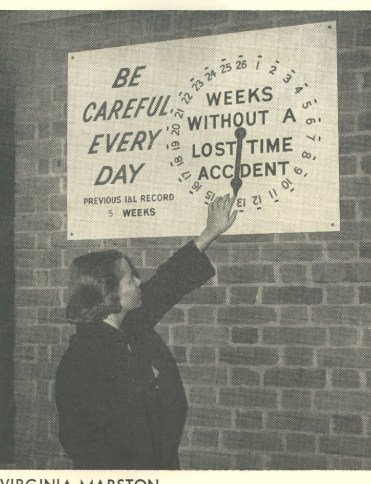
VIRGINIA MARSTON sets safety clock dial at 14 weeks.