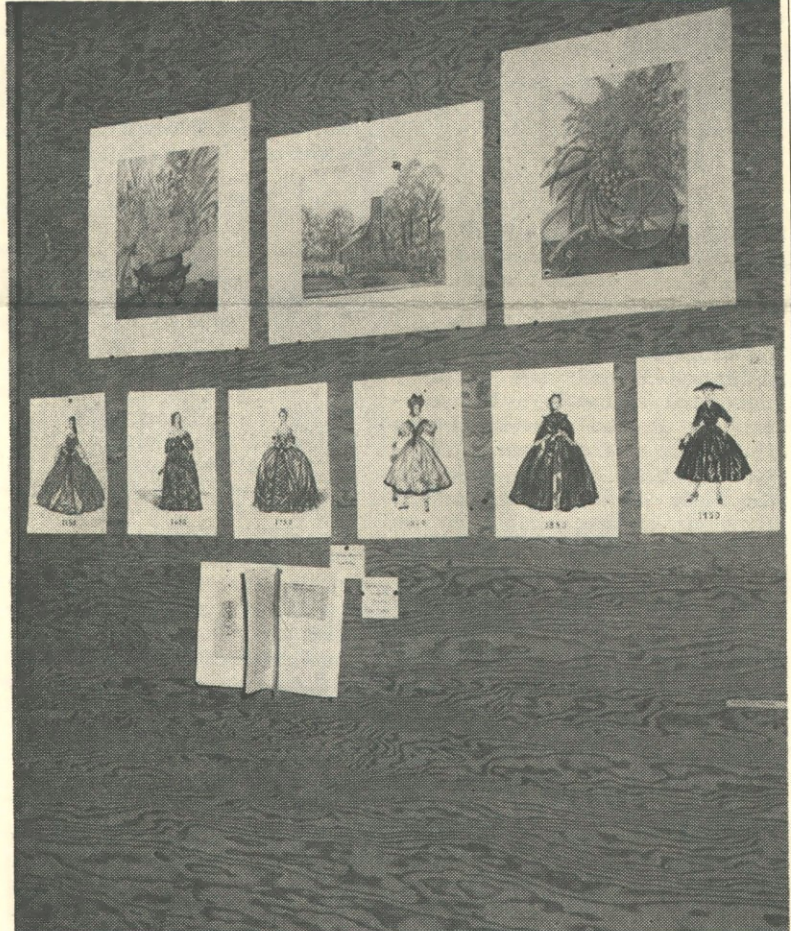
A HOSTESS'S HOBBY, is in this case sketching hostesses costumes through the centuries. This exhibit at the Community Night show, displaying the type of dress worn by hostesses from 1550 to 1950, was entered by Elizabeth Hickey of the Hostess section. The