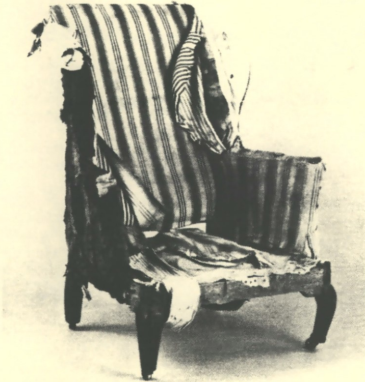
This easy chair in "Curtains, Cases and Chairs: Upholstery Documents at Colonial Williamsburg," features layers of original upholstery fabrics ranging from the 1740s to the 1960s.

The "18th-century Fair within a Fair" is produced under the auspices of the Virginia Commission on the Bicentennial of the United States Constitution, with assistance from Colonial Williamsburg.