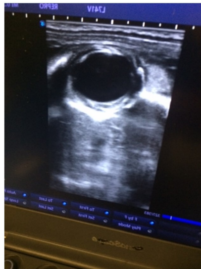
Foal's Eye Socket