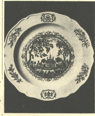
Commemorative Plate Craft House and the hotel Gift Shops are now offering for sale individual Commemorative Plate.

The well-known "First Edition" plates were issued in 1950, but these are only sold in complete sets of 12, priced at $25. Now, for the first time, a single plate