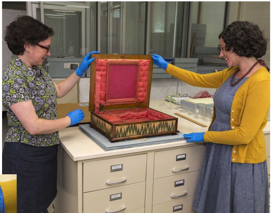
Left: Treatment of delicate textiles is performed only when necessary and with care to preserve the integrity of the original work. Above: This box, lined with silk dyed bright pink, contains a secret compartment and may have held jewelry or other small items. It will be part of an exhibit featuring British goods.