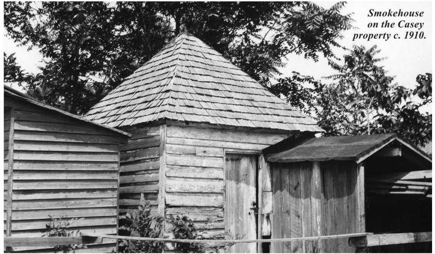
Smokehouse on the Casey property c. 1910.

The “Barraud” privy was originally located about 60 feet