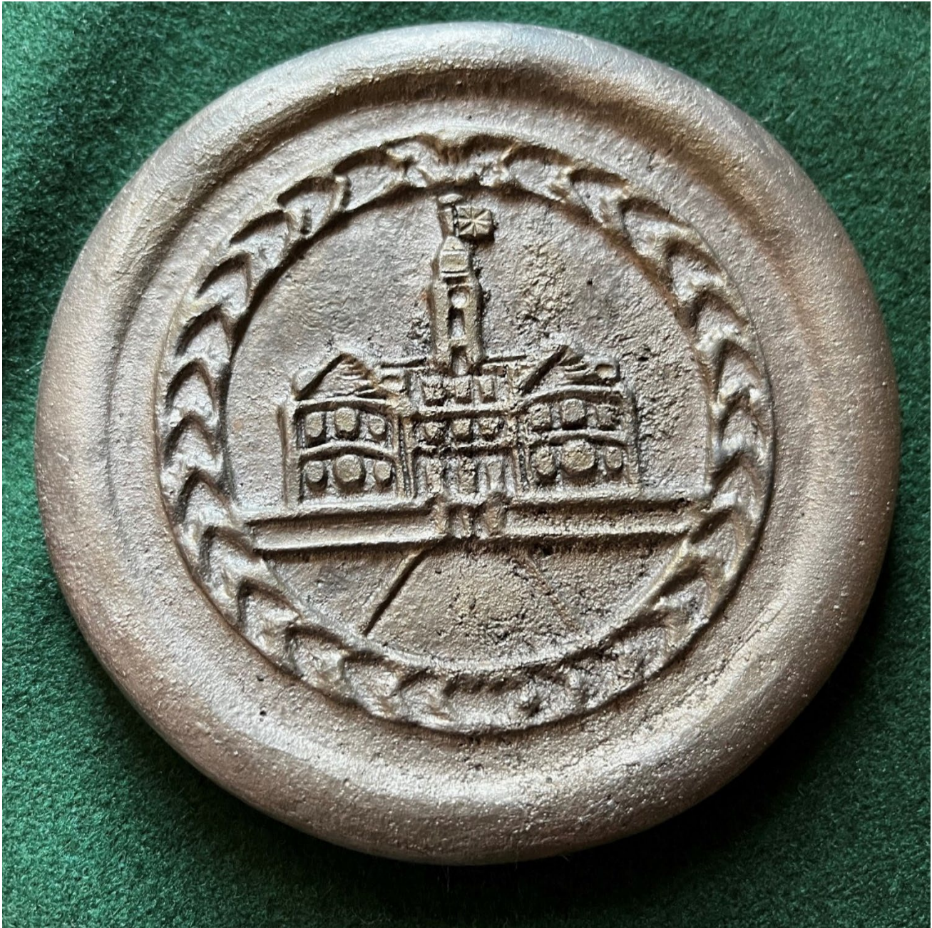
A completed cast iron CW seal; we also make them in pewter, bronze and sterling silver.

Founder – The Founders have been busy this week continuing work on the donor gifts of the CW seals. We plan to make some molds this Friday for a private order and cast the brass for them on Saturday.