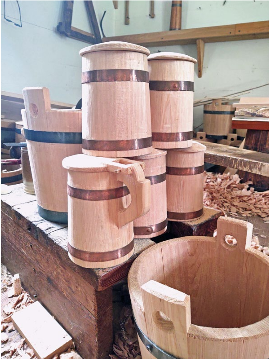
These cannikins are just part of an order for the Lewes (Delaware) Historical Society.