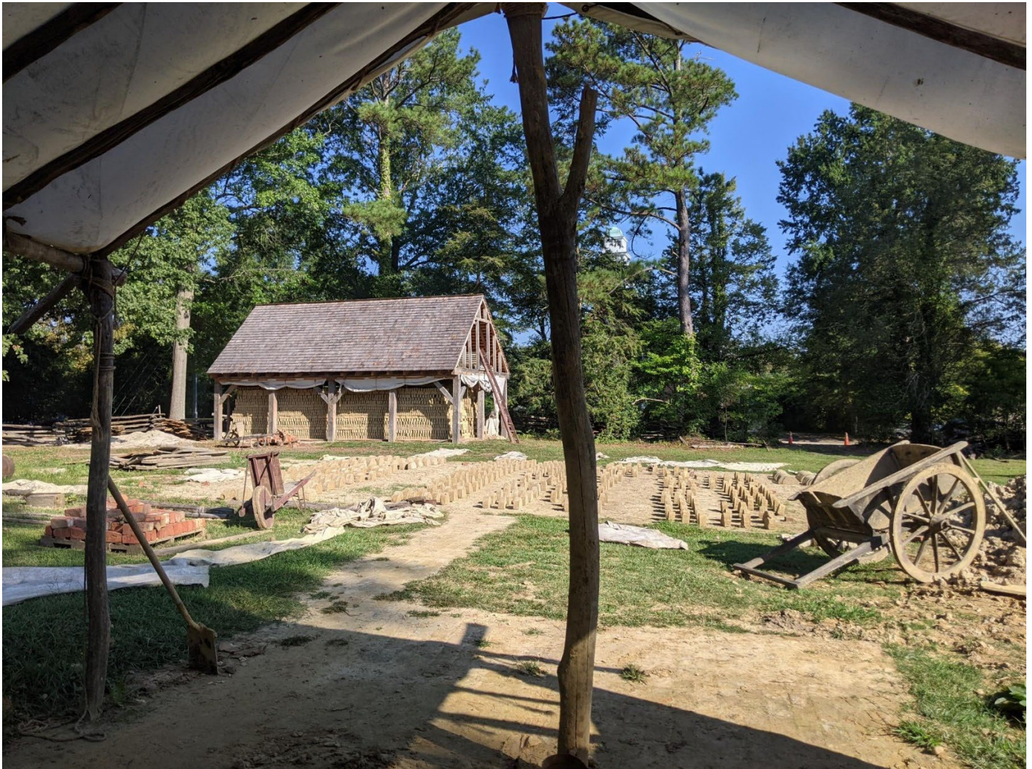
The coping bricks fill up our drying bed quite fast.

Mason – This week in the Brickyard the crew steadily lost their numbers as several of the summer crew are leaving the nest to take the gospel of brick far and wide. Otherwise, this week production of coping bricks continued and are being moved into the carpenter's saw house as they dry. This size of brick will likely be what finishes out or summer in the next few weeks.