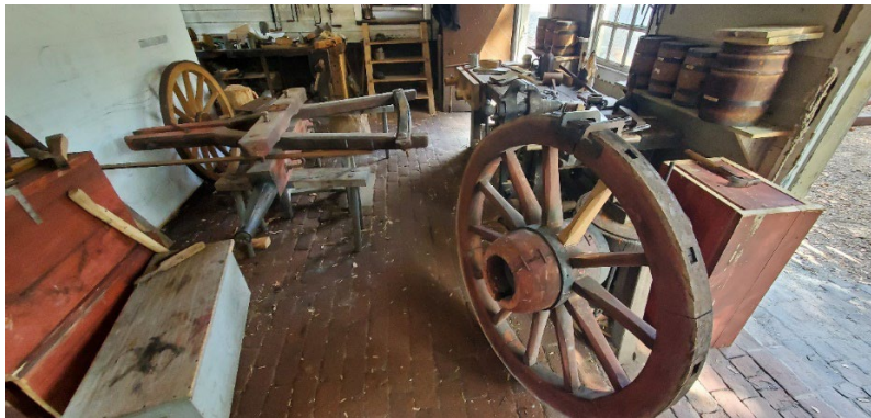
Repaired front wheel and fore undercarriage.