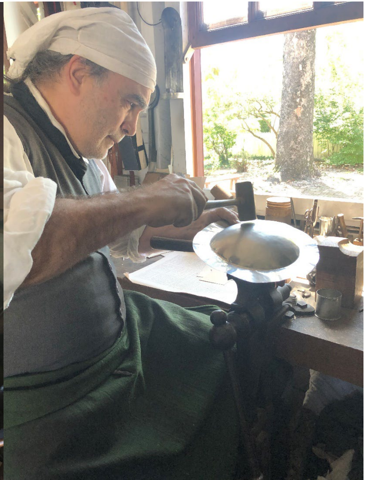
Smoothing out the domed lid at the end of the day.

The Tin Plate Worker is open Tuesday, Wednesday, Friday, and Saturday.