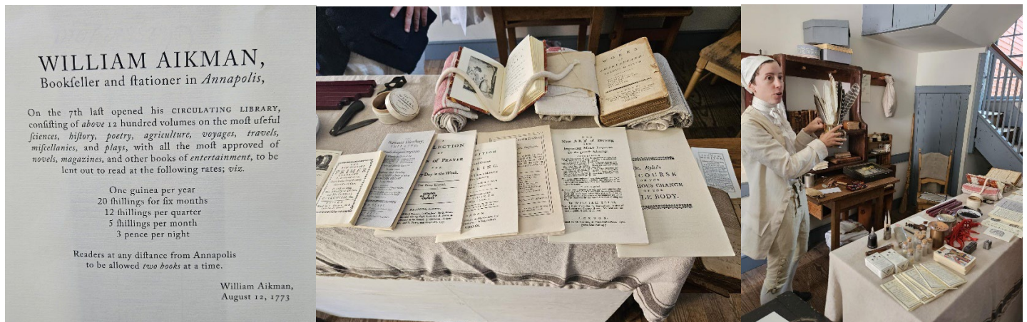
Historic advertisement explaining the fee system and terms for Aikman's Subscription Library.

It's fun to put all the pieces together, and it is valuable to see what a sibling museum is doing to bring history to life! Bravo, Historic Annapolis!