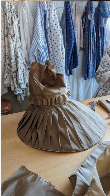
On the left: Covering the back is one of the trickiest parts...