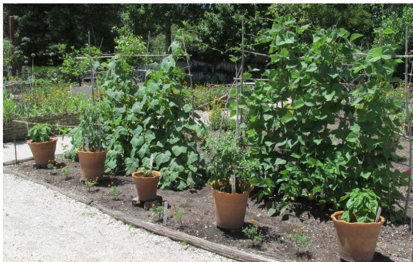
A row of potted chilis greet Guests to the Garden.