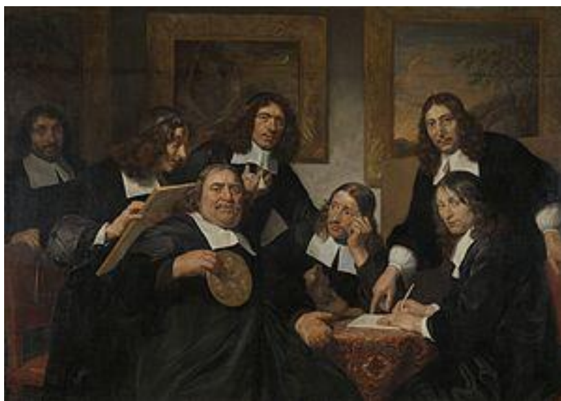
The “Dutch Master’s” examining an interior door from the Bray School (left). Painting by Jan De Bray (right). The Joiner is open Sunday, Tuesday, and Thursday through Saturday.