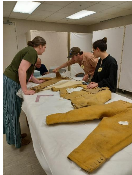
The Leather Breeches Maker is open Sunday, Tuesday, and Thursday through Saturday.