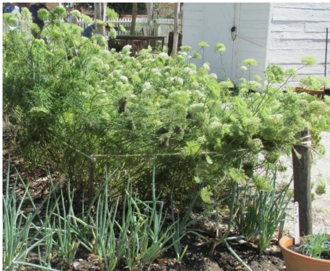
Carrots in bloom knocked down by an inch (!) of rain and laying amongst the Welsh onions ( Allium fistulosum ) (left). Carrots held up by ropes and stakes (right).