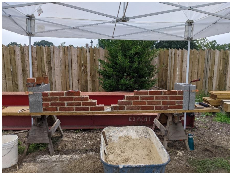
The Brickyard is open Daily, weather permitting.

Military Programs – Military Programs is gearing up for the July 4th weekend. We will be looking forward to creating new Guest experiences through our drill programs at 12:30 pm on Saturday and Sunday, as well as July 4th programming we are participating in, to include “The Salute to the States”, the reading of the Declaration of Independence, and the evening festivities just prior to fireworks. Hope to see you there!