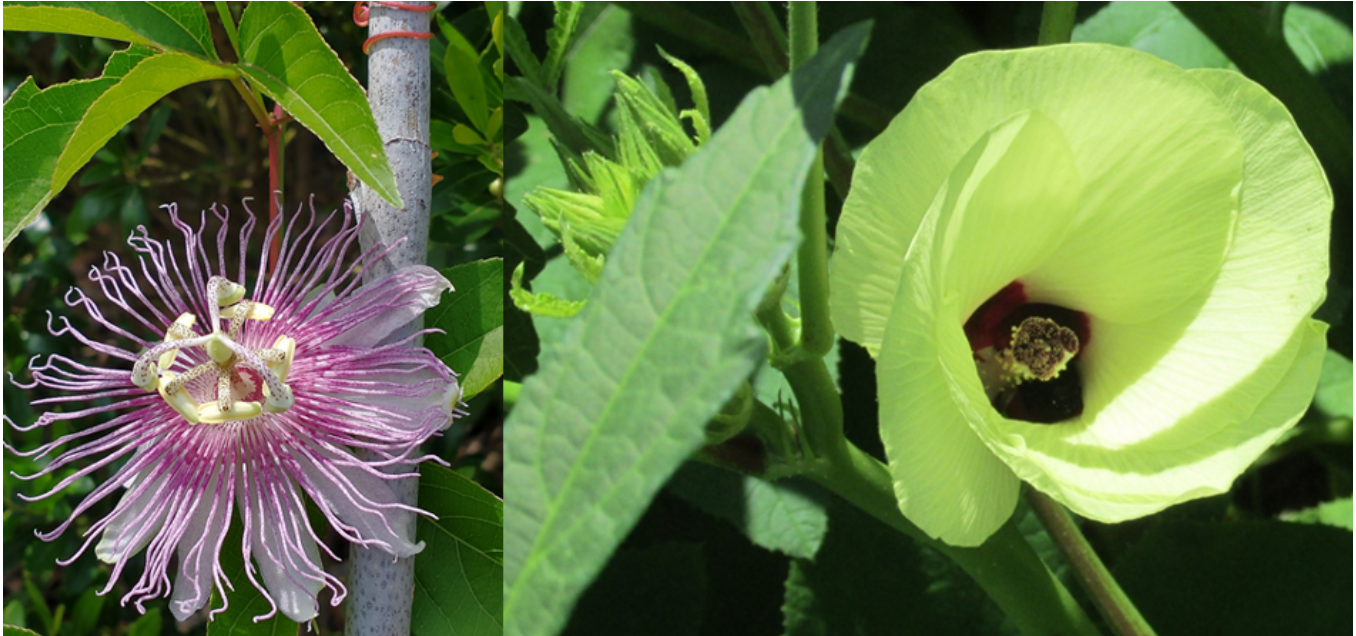
The bloom of Passiflora incarnata only lasts a single day.

Gardener – Two delightful flowers graced the Historic Garden this week. A carefully cultivated purple passionflower unfurled its unique blossom to the delight of bees and guests. At the other end of the garden, the okra in the West African vegetable plot bloomed despite the depredations of rogue deer that cut a swath in the sweet potatoes ( Ipomoea batatas ).