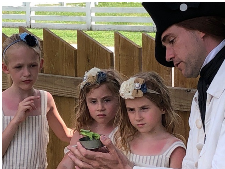
Showing a tobacco hornworm always captures interest.

The Farmer is at Ewing Field Wednesday through Saturday, weather permitting.