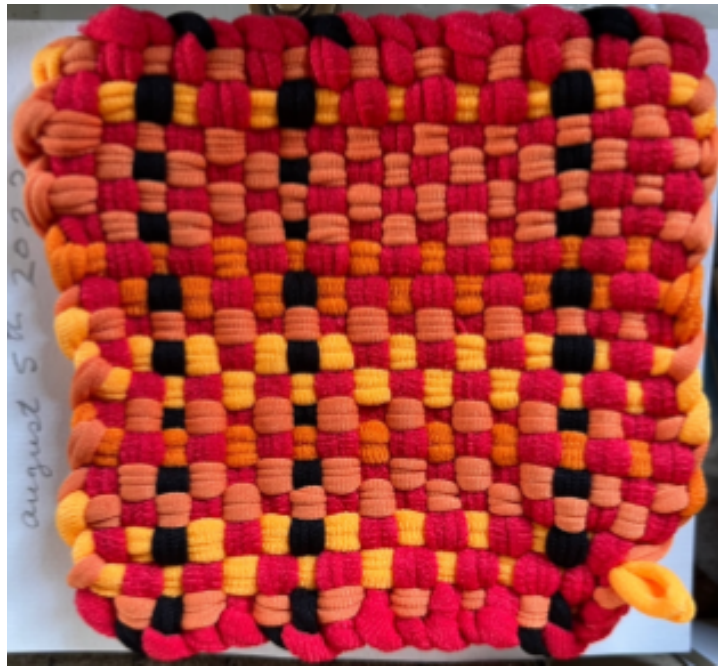
"L," Hand-woven, Acrylic fiber, 2023

This encounter happened on the last day of a week of interpreting alone in the shop, and this was a shot in the arm. It made my day, my week. There are certainly more of these interactions than those that show up in the visitor satisfaction surveys, but they count as much. Note to myself: I do not scare all the kids.