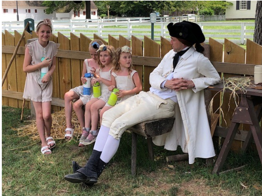
Colonel Washington tells tales of his boyhood on the farm.

Farmer – The Nationbuilder at the Ewing Field program has been going really well. It is a program where guests of all ages can chat with someone who loves agriculture. The Nationbuilder has usually been Colonel or General Washington and sometimes James Madison. The guests love it!