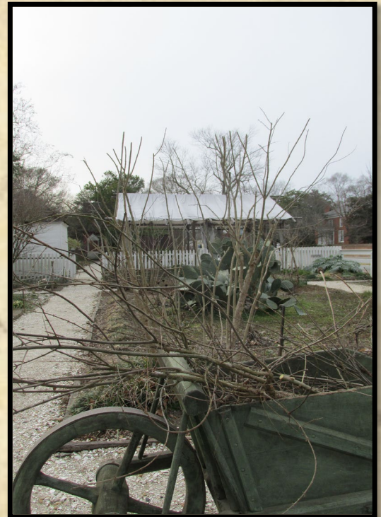
A pruned tree showing some of the removed branches.