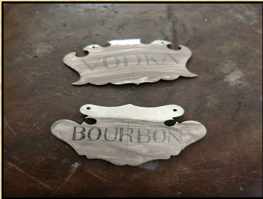
Two bottle tickets set up and ready for engraving.