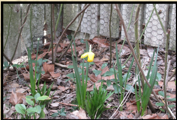
The first Narcissus blooming the garden, joining the hundreds of other examples in the historic area.