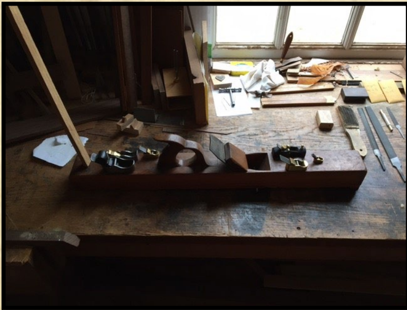
Planes for Musical Instrument Making