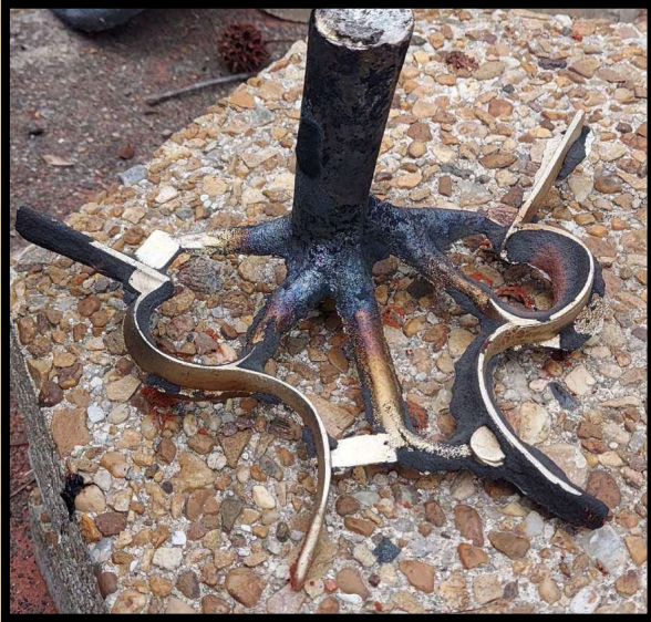
The cast brass trigger guards still attached to the gates and sprue.