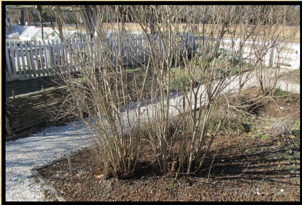
A Punica granatum before pruning.