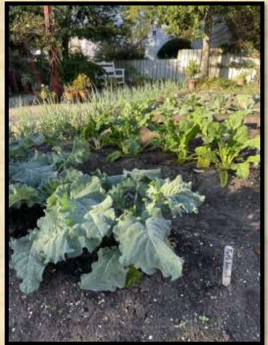
Broccoli and other cool-season vegetables