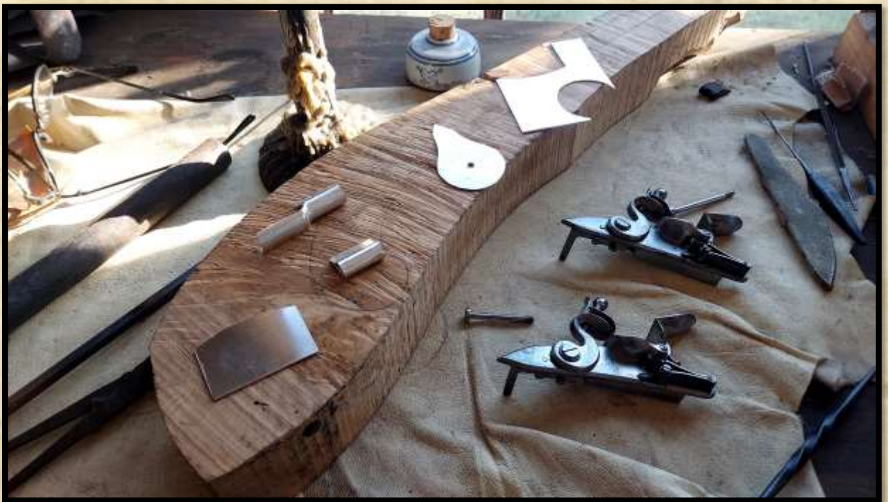
The components for the next silver mounted pistol.