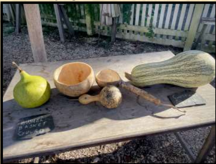
A selection of gourds and an edible cushaw squash