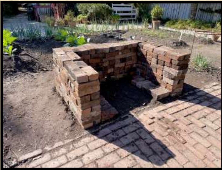
Brick fire pit in the Historic Garden