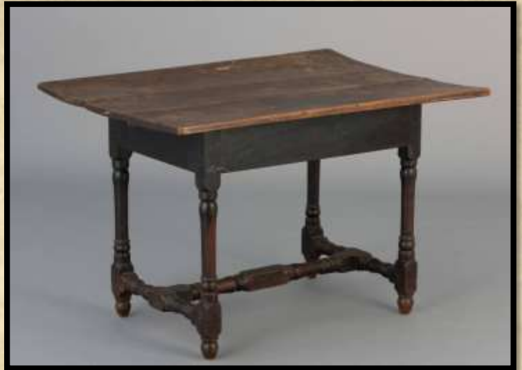
Black walnut table, Obj 1933-36 in the CWF Collections

For those of you curious about our upcoming projects, we'd like to share a look into some of the original pieces we have been studying for reproduction. For the Bray School, we expect to make a mixture of chairs, tables, chests, and benches. Apprentice Laura will be tackling a walnut table, based on Obj 1933-36, which has turned legs and stretchers and will be a great introduction to turning.