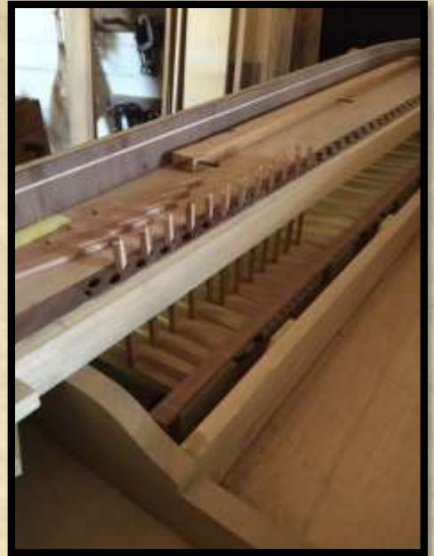
Fitting up the Action.