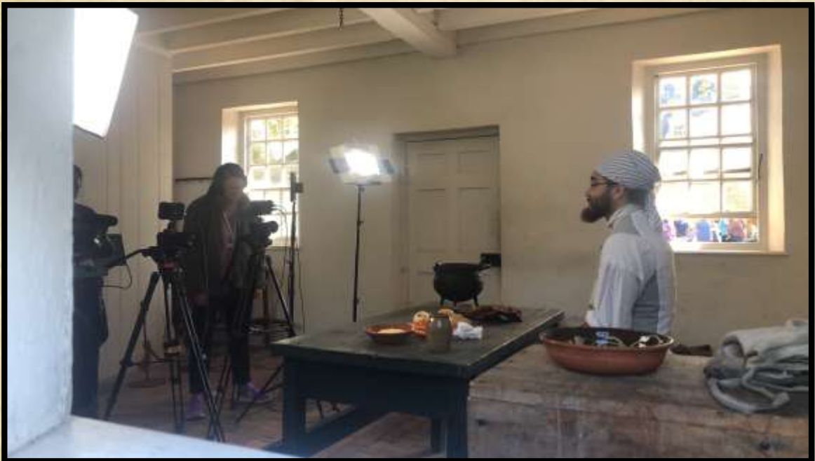
A behind-the-scenes shot of Dom being interviewed in the Scullery.