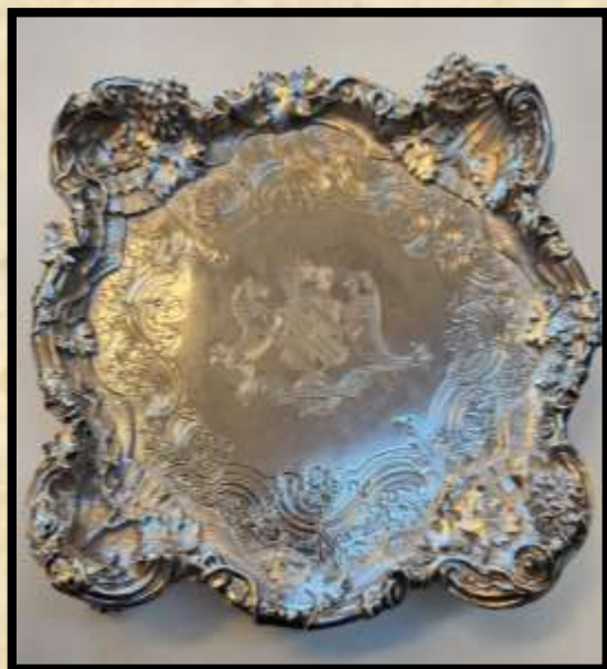
A silver sauceboat stand bearing the arms of Lord Admiral George Anson.