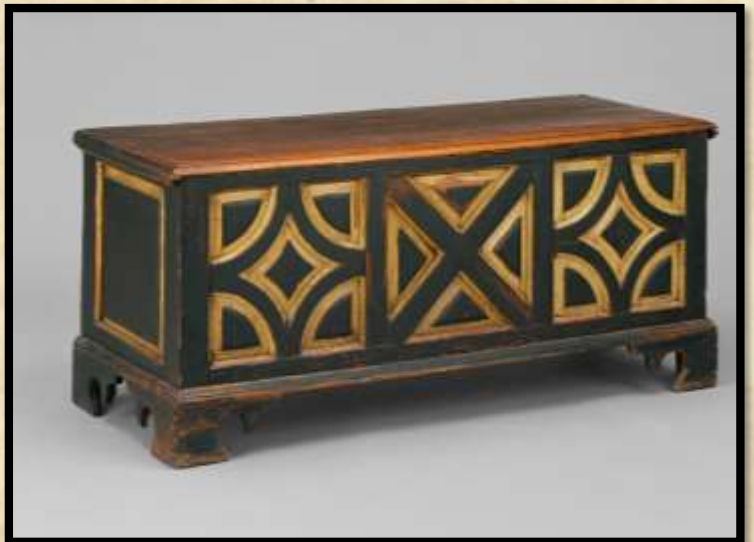
Eastern shore yellow pine blanket chest, Obj 1930-108 in the CWF Collections

Also quickly approaching is the upcoming Working Wood in the 18th Century conference. For this symposium, Journeyman Peter and Master Brian will be presenting on an Eastern Shore blanket chest, Obj 1930-108, which features some eye-catching panels.