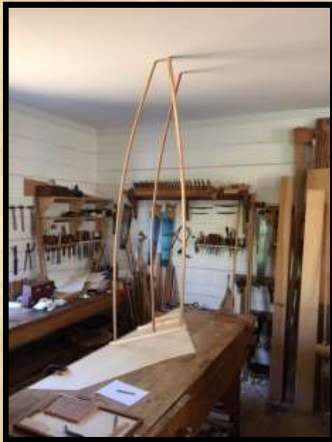
Go-bars Clamping Ribs to Soundboard.