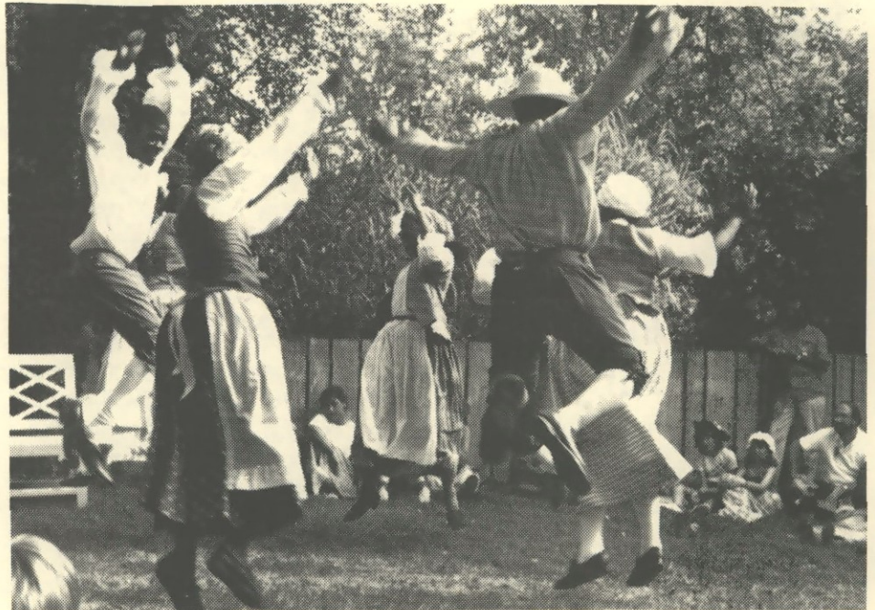
Dancers perform "Panlogo," a dance typical of the 18th century, as part of the Black Music Program offered Friday evenings at 5:30 at the Playbooth Theatre.

Congratulations on receiving Colonial Williamsburg's highest honor!