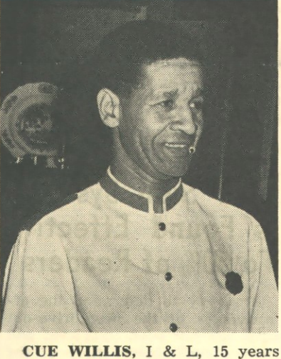
with CW on June 10.