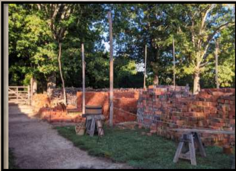
The casing for the kiln with the posts for our shelter.