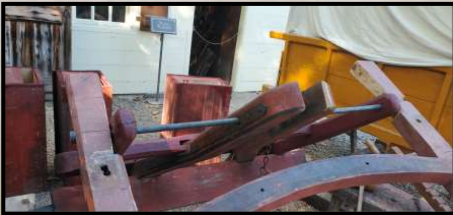
Shaft pin in situ.