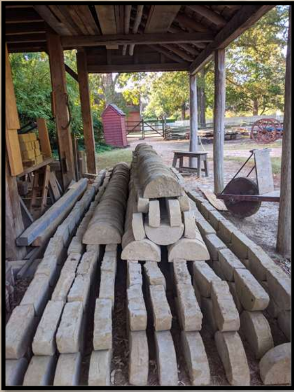
Sundried coping bricks taking shelter in the saw house.

The Brickyard is open Wednesday through Sunday, weather permitting