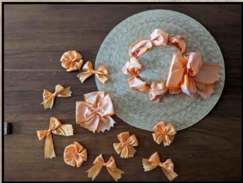
Orange knots and a trimmed hat created to mark Orange Shirt Day on September 30th.

The Milliner and Mantua-maker is open Tuesday through Saturday