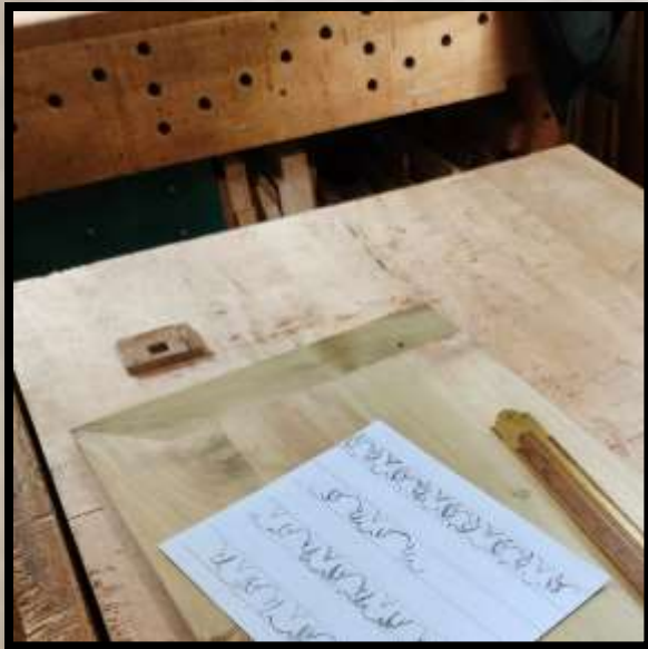
a drawing board made of poplar

“These past weeks, Bill has been doing some sketching and design brainstorming for our upcoming conference in January. John has been working on a few side projects- a miter square for laying out 45 and 135 degree angles, which has helped him make a drawing board that imitates upcoming work on the cellaret.”