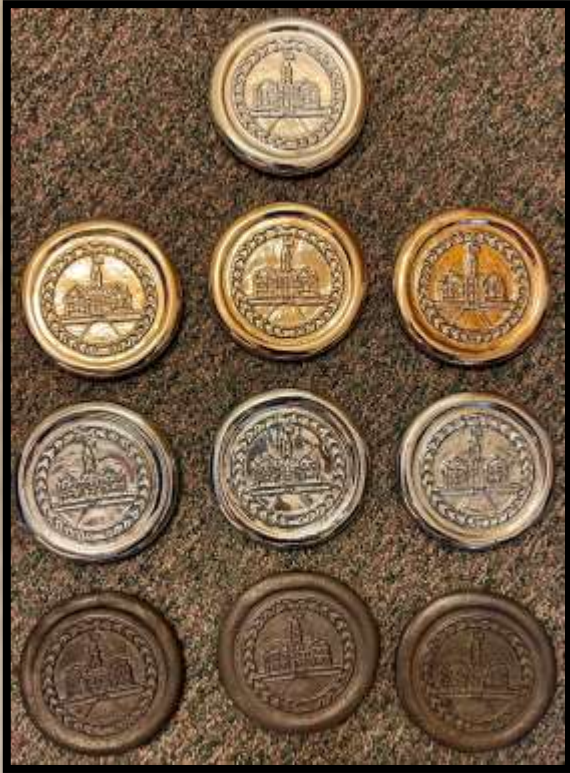
The completed CW seals.

The Foundry is open Tuesday, Wednesday, Friday, and Saturday.