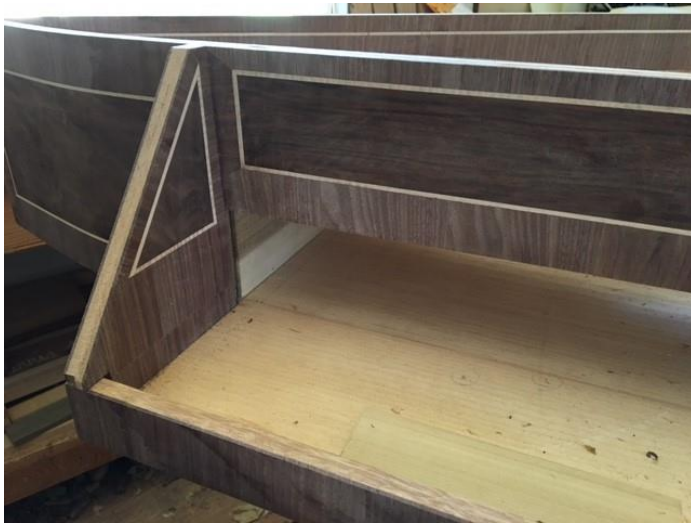
Front panel and bass cheek finished veneer