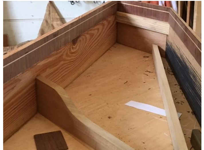
Interior of the Spinet