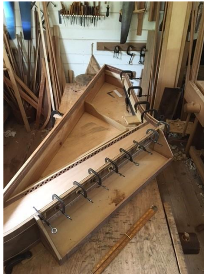
Clamps installation interior work