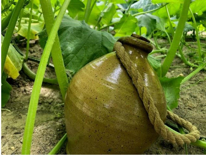
A jug of water keeping cool in the shade of pumpkins

Farmer – Field work doesn't stop when it's hot. Thriving depends on water and a hat.