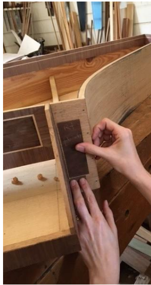
Veneer decoration in progress