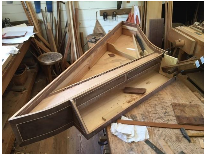
The Spinet, so far

The Harpsichordmaker is open Sunday (11:30-5:00), Monday, and Thursday through Saturday.