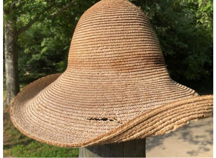
A good straw hat toasted under the Virginia sun

The Farmer is at Ewing Field Wednesday through Saturday, weather permitting.