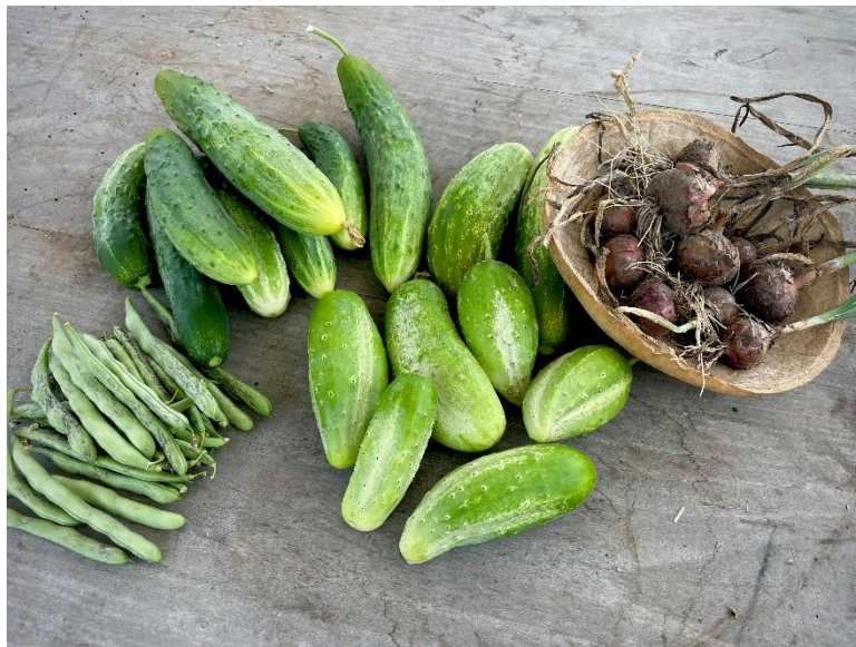
Cucumbers, onions, and beans harvested at the Historic Garden