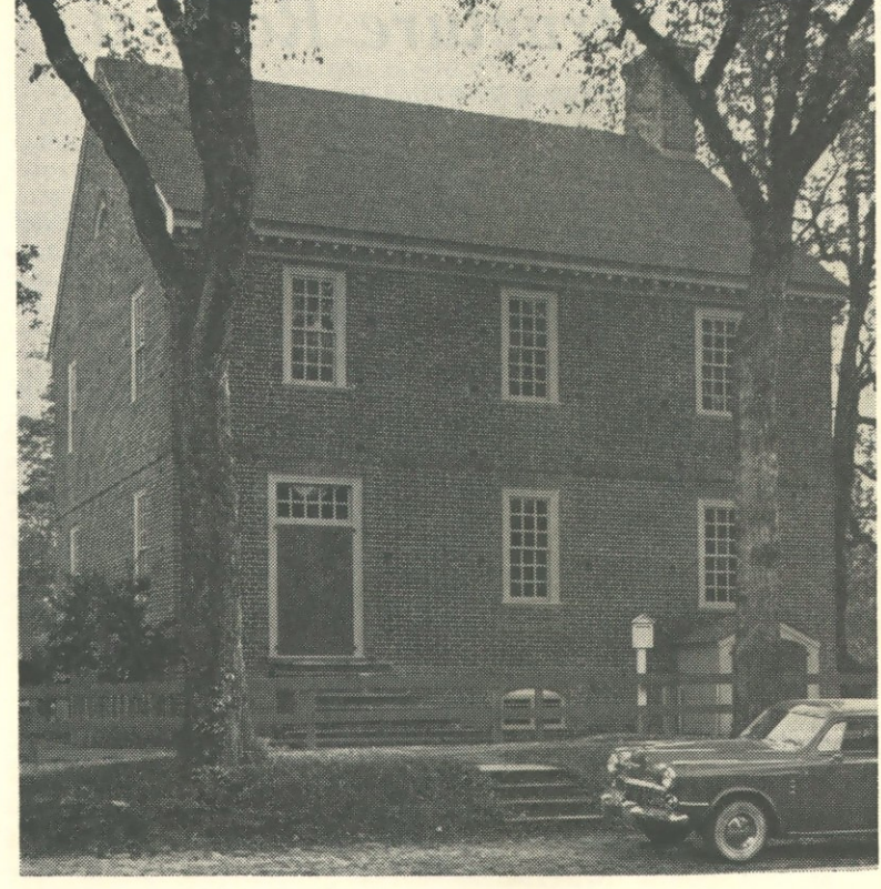
THE PALMER HOUSE restored and ready for residence.

The cards will be available at Col. Wheat's office in the basement of the Goodwin Building daily from 2-4 p. m. from the sale date until Christmas Eve. Each box of 10 cards will be sold at $.60 (a saving of 40% over the regular