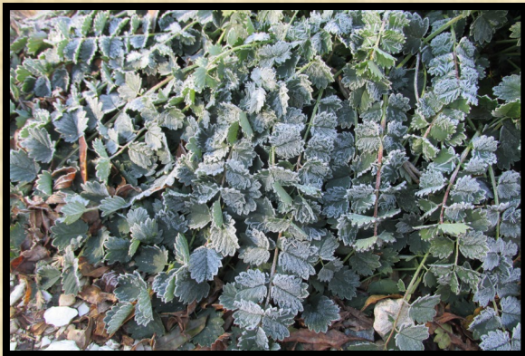
Healthy salad burnet (Sanguisorba minor) despite the frost.