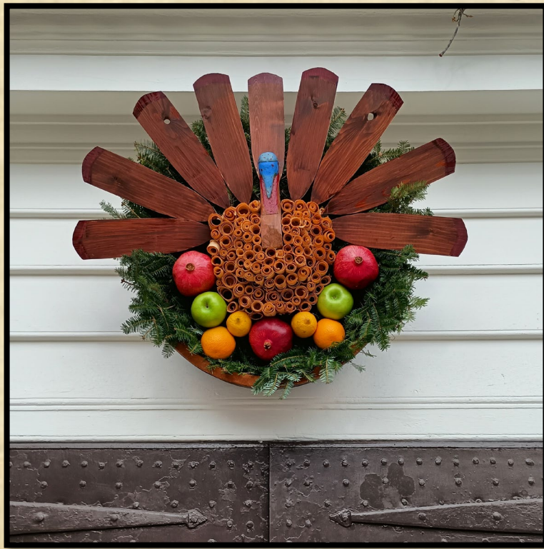
This year's wreath at the Coopers Shop.