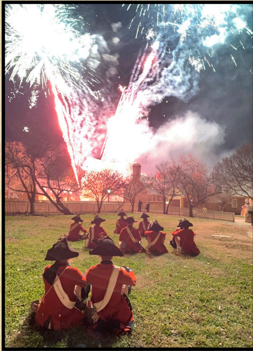
The Sr. Corps enjoying watching the fireworks last Saturday.