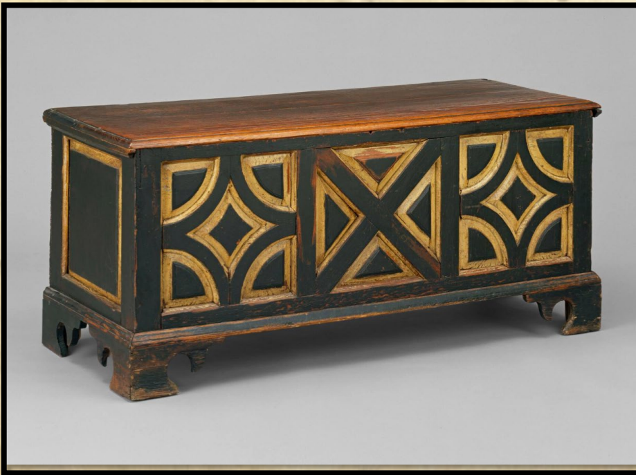
Eastern Shore Blanket Chest, 1795-1805, Museum Object Number 1930- 108.