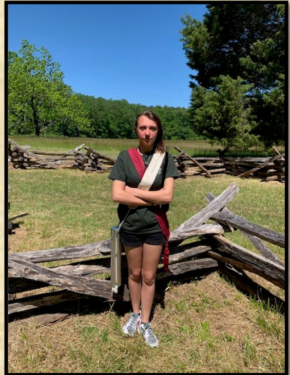
Our new fife instructor.