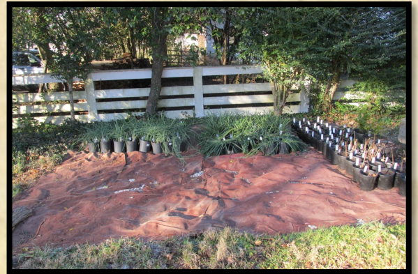
More perennials potted for transport to the new garden.