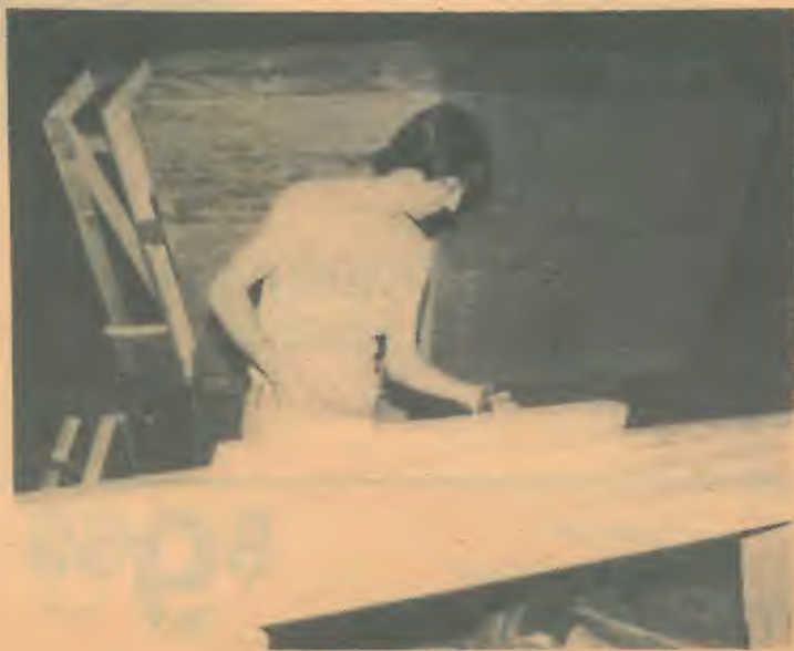
DISCO STATION - Workmen are making several changes to the Parliament House's Power House Disco including the construction of a new control booth for the sound and lighting technicians. Plans also call for resurfacing the dance floor according to resorpsomen. Other improvements and renovations will be taking place over the next few months and are scheduled to include a new window wall looking out on the resort's enclosed patio.