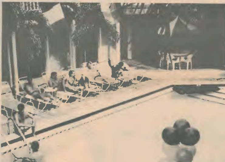
Pool side at the IslandHouse Resort Complex in Key West.