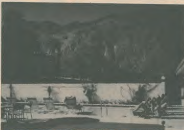
A pool scene at Alexander Resort in Palm Springs, Calif., with a view of the San Jacinto Mountains.

A pleasant Key West afternoon can be shopping along Duval or in Mallory square, or perhaps a visit to the "Gay Beach" at Reynolds Street Pier or poolside at your hotel. And the dining is a treat at the Rooftop Cafe on Front Street or Antonia's or