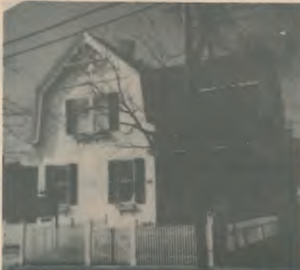
Plum's Bed and Breakfast in Provincetown, Mass. An 1860 Captain's House, owned by women for women.

Cafe in Exile on Duval or the historic Pigeon House just to name a few. Nightlife for the guys offers the Copa Complex, One Saloon and the 801, "where the locals meet." The gals will be comfortable at the 416 Cafe on Appelrouth.