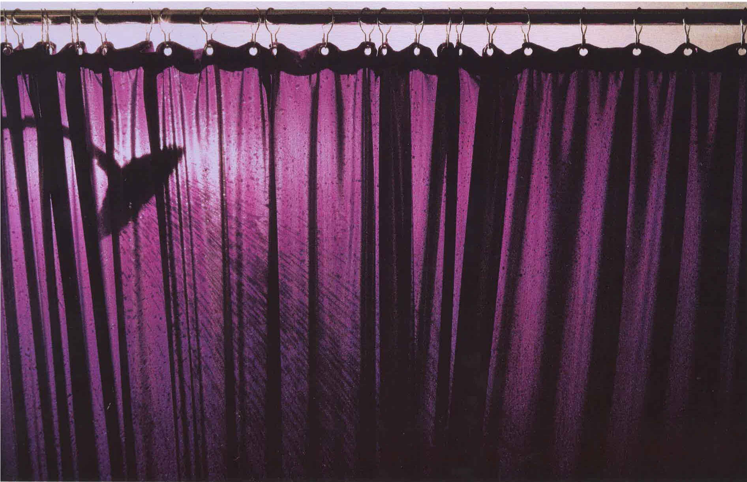
Shower Curtain - Graham Ford