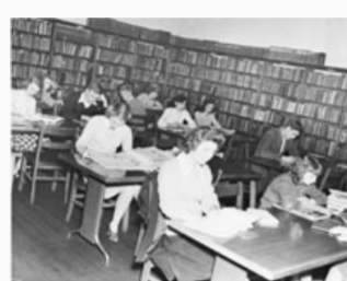
Library at Pulaski High School, Plaintiff's Exhibit. View larger image