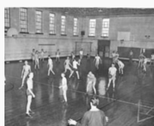
Boys' Gym at Pulaski High School, Plaintiff's Exhibit. View larger image