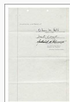
Plaintiff's Motion to Enter School. Page 2 View larger image