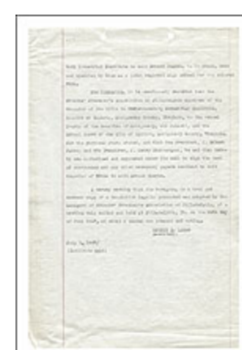
Defendants' Exhibit, Ownership History of Christiansburg Institute. Page 2 View larger image