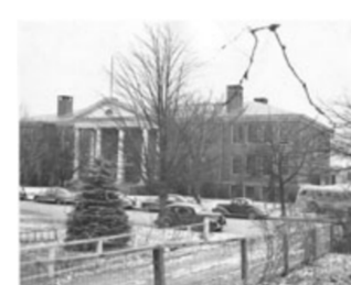
Exterior of Pulaski High School, Plaintiff's Exhibit. View larger image