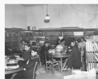
Library at Christiansburg Institute, Plaintiff's Exhibit. View larger image