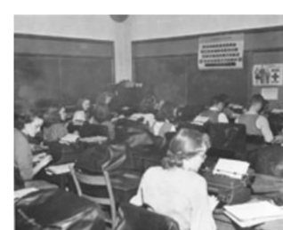
Pulaski Typing Classroom, Plaintiff's Exhibit. View larger image