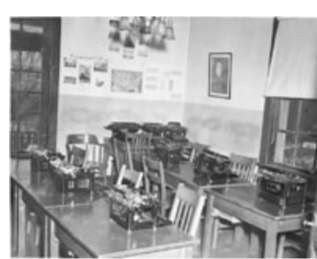
Christiansburg Typing Classroom, Plaintiff's Exhibit. View larger image