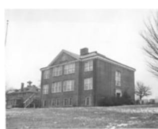
Exterior of Christiansburg Institute, Plaintiff's Exhibit. View larger image