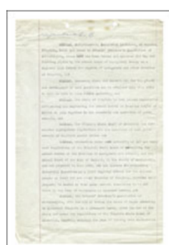
Defendants' Exhibit, Ownership History of Christiansburg Institute. Page 1 View larger image