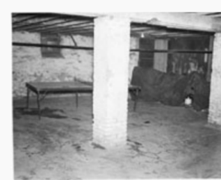
Boys' Gym at Christiansburg Institute, Plaintiff's Exhibit. View larger image