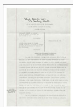
Plaintiff's Motion to Enter School. Page 1 View larger image