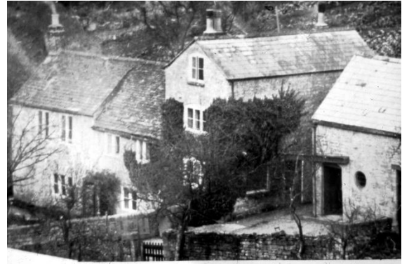
The Old Mill