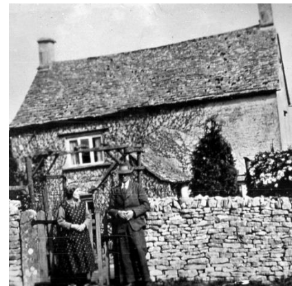
Thought to be Laburnum Cottage