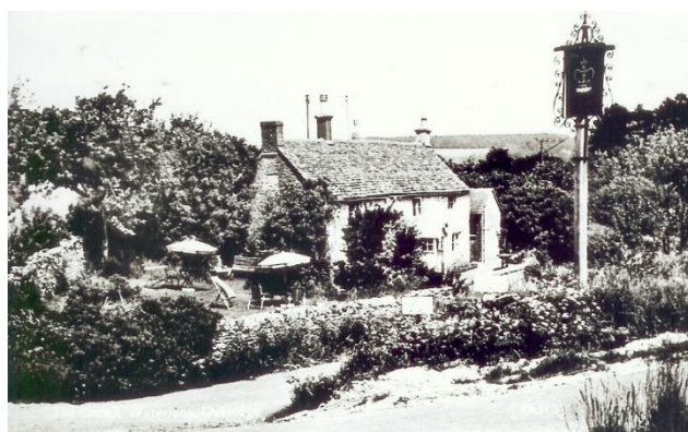
The Crown Inn, Waterlane

Tom volunteered for the Army Service Corp in 1914/5.