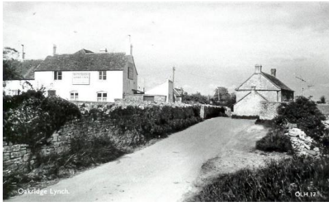
The Butchers Arms