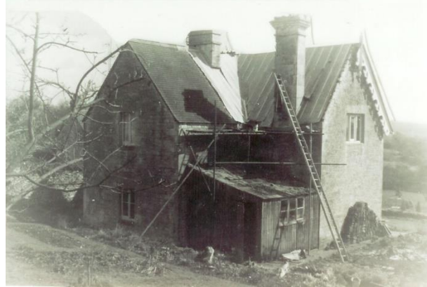
The School House

He served from 1914 – 1920 first as a private in the Devonshire Regiment and later as a 2nd Lieutenant in the West Riding Regiment He was awarded medals for gallantry and long service.