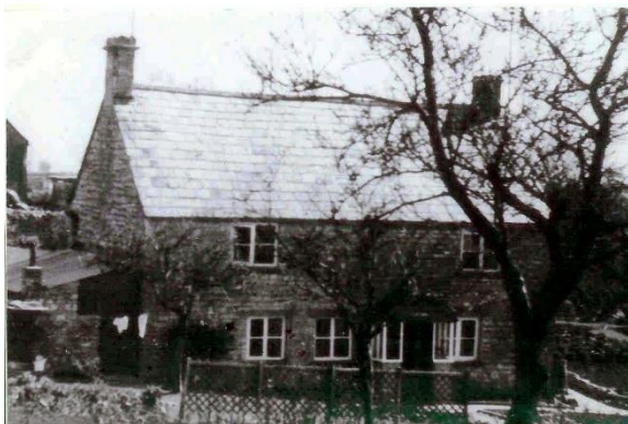
West View Cottage (Since Demolished)

Harold Gardiner was born in Oakridge Lynch.