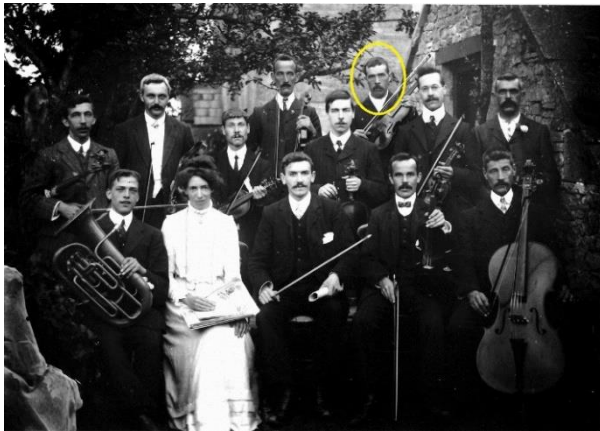
Oakridge Orchestra 1910 - 1920