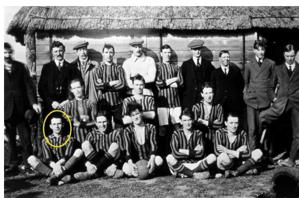
Oakridge Football Team 1900's