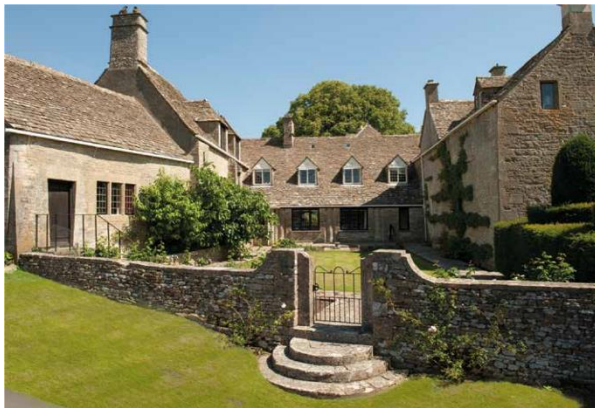
Isles Green Farm House