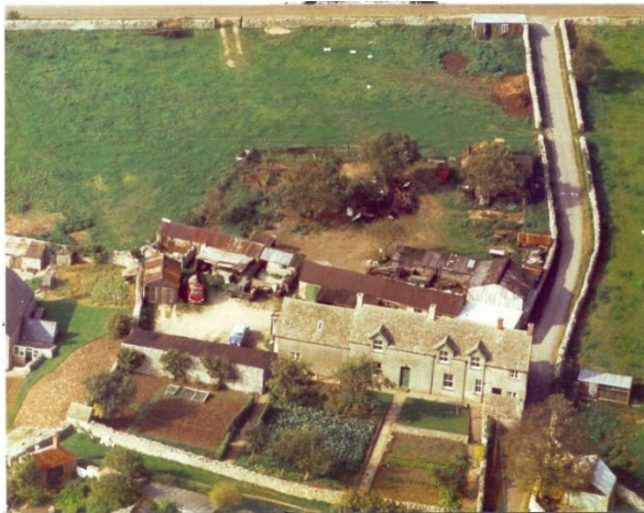
Fair View Farm / House

James Pegler was born in Waterlane and baptised on 10 March 1889 in Oakridge Church.