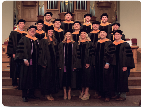
Doctor of nurse anesthesia practice graduates.

In May of 2017, the first class of nurse anesthesia graduates received their doctor of nurse anesthesia practice (DNAP) degree. They boasted a 94 percent first time pass rate on the advanced practice licensing examination.