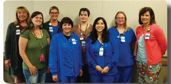
Great Plains Health staff with RN to BSN students.

In order to fulfill the need of bachelor of science (BSN) degrees in the community, Bryan College of Health Sciences and Great Plains Health in North Platte are partnering to increase access to the BSN program in western Nebraska. This fully accredited RN to BSN program allows current RNs to complete their BSN while working full time in just a year and a half. The program began with 10 students, and has now added five additional seats that are available to RNs outside of Great Plains Health. The hybrid format allows Bryan College of Health Sciences faculty to travel to North Platte to deliver face-to-face classroom time, while the rest of the course work is completed online. We are excited about this opportunity to broaden educational opportunities in rural Nebraska.