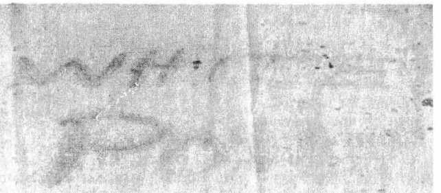
Signs of our times . . . .