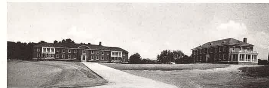
HOSPITAL AND NURSES' HOME

As the representative of the official public health authority in Sullivan County, which is profoundly interested in all measures designed to preserve the health of the people in the county, it is natural that I should have a feeling of commendation for the efforts which have been put forward to have this institution built and equipped.