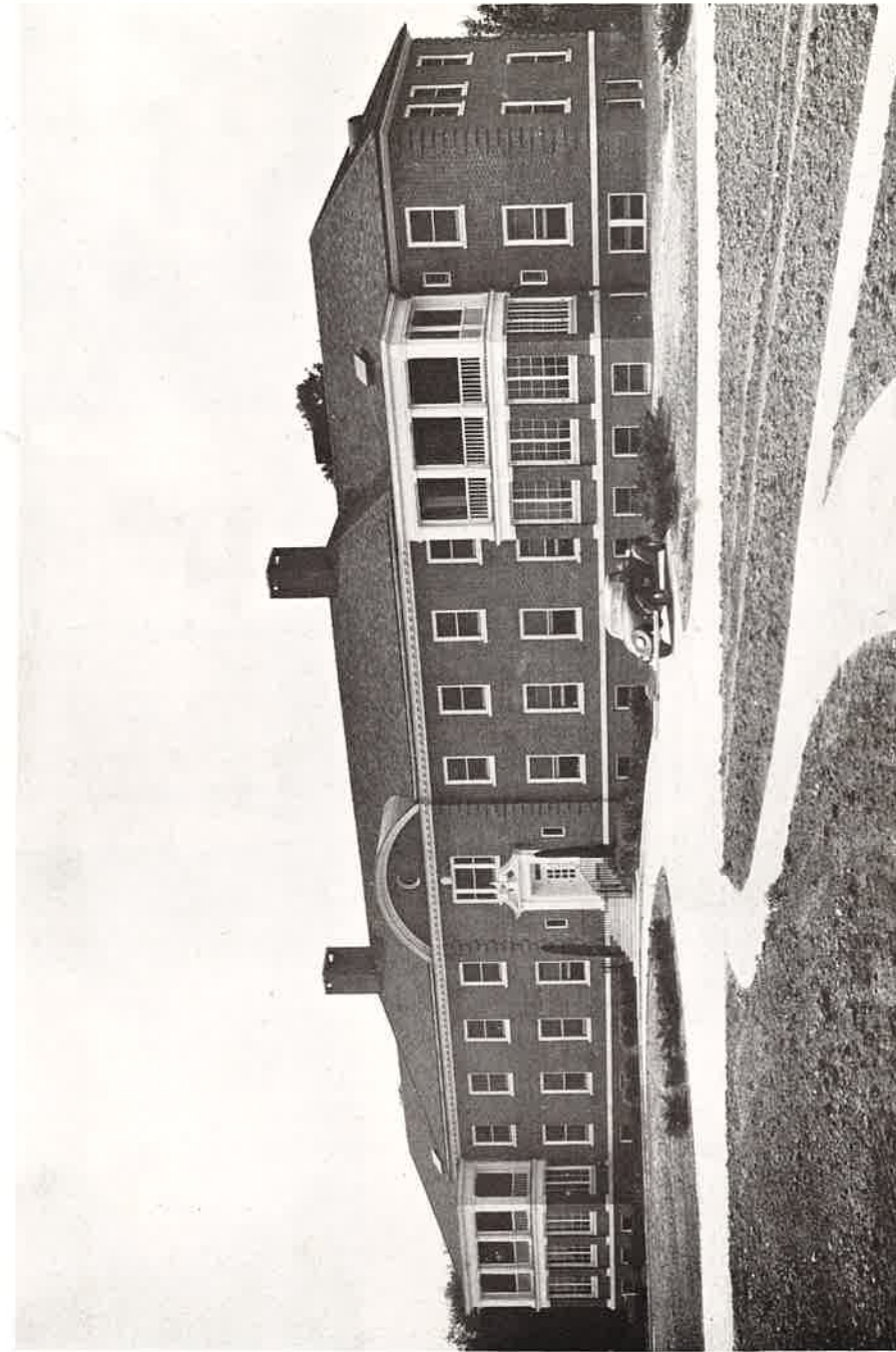
HOLSTON VALLEY COMMUNITY HOSPITAL