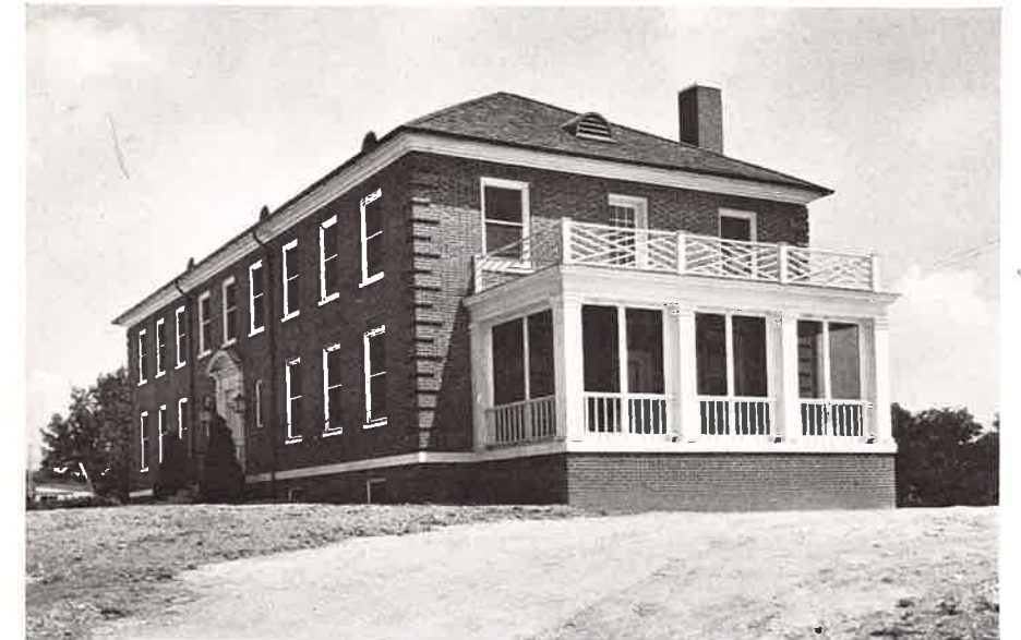
HOME ACCOMMODATING TWENTY-FIVE NURSES