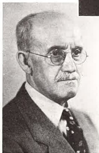
HON. R. W. RUSH Mayor, Bluff City