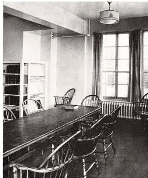
A CORNER IN THE MEDICAL LIBRARY

Monthly meetings of the Staff have been begun in accordance with the requirement of the American College of Surgeons, the national agency of hospital standardization; the Holston Valley Community Hospital is committed to operation at the high level necessary to secure the College's approval as a standard institution. After its preliminary work of organization and definition of professional standards, the Medical Staff will sponsor regular scientific sessions in which the members will be assisted by invited guests who are distinguished in their fields of medical and surgical practice.