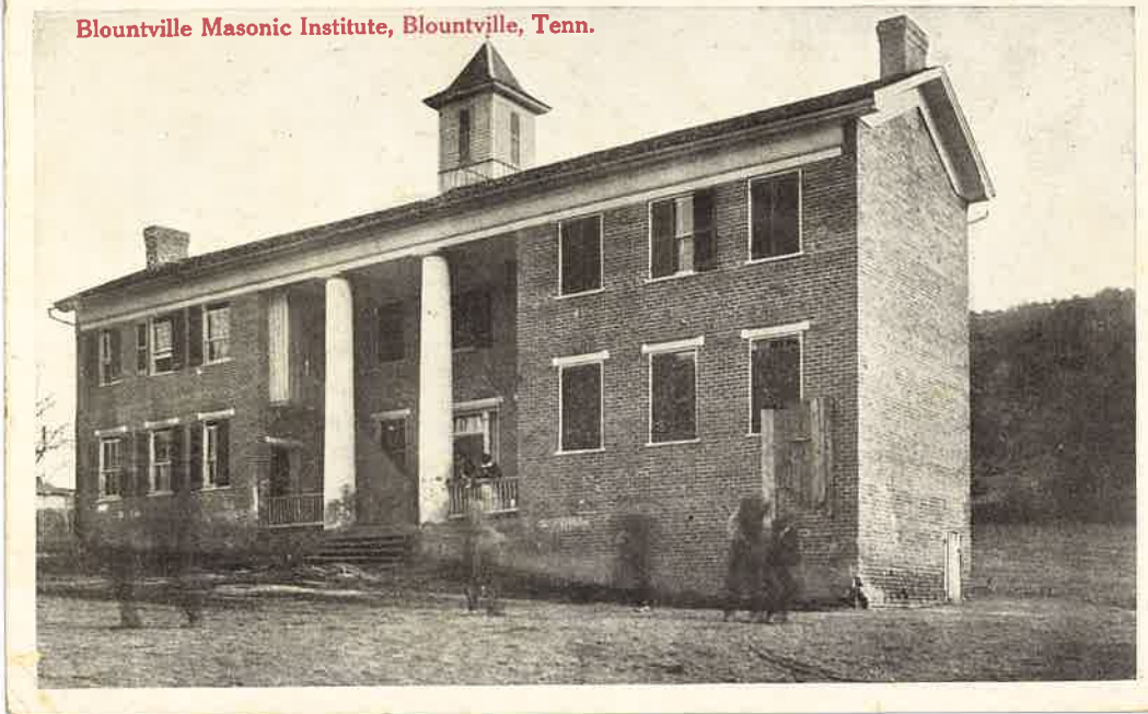
Blountville Masonic Institute, Blountville, Tenn.