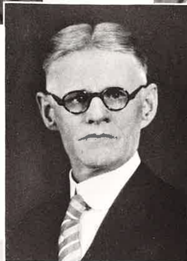
HON. W. L. HOLYOKE Mayor City of Kingsport