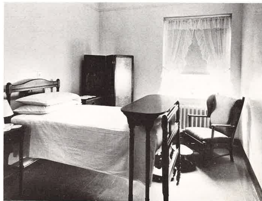
A PRIVATE ROOM