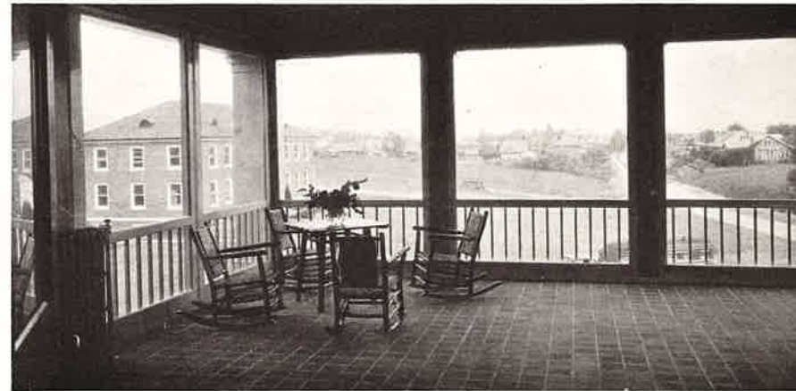
A VISTA FROM ONE OF THE THREE PATIENTS' PORCHES