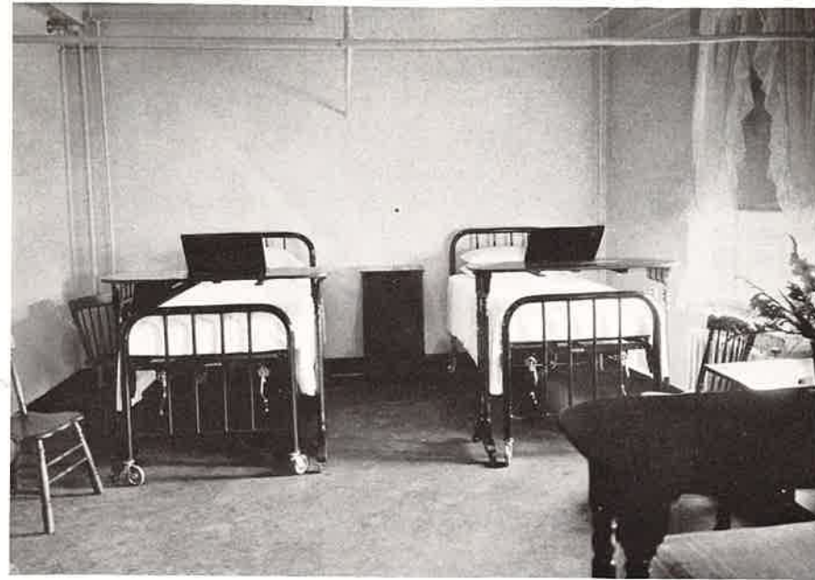
ONE SIDE OF A FOUR-BED WARD