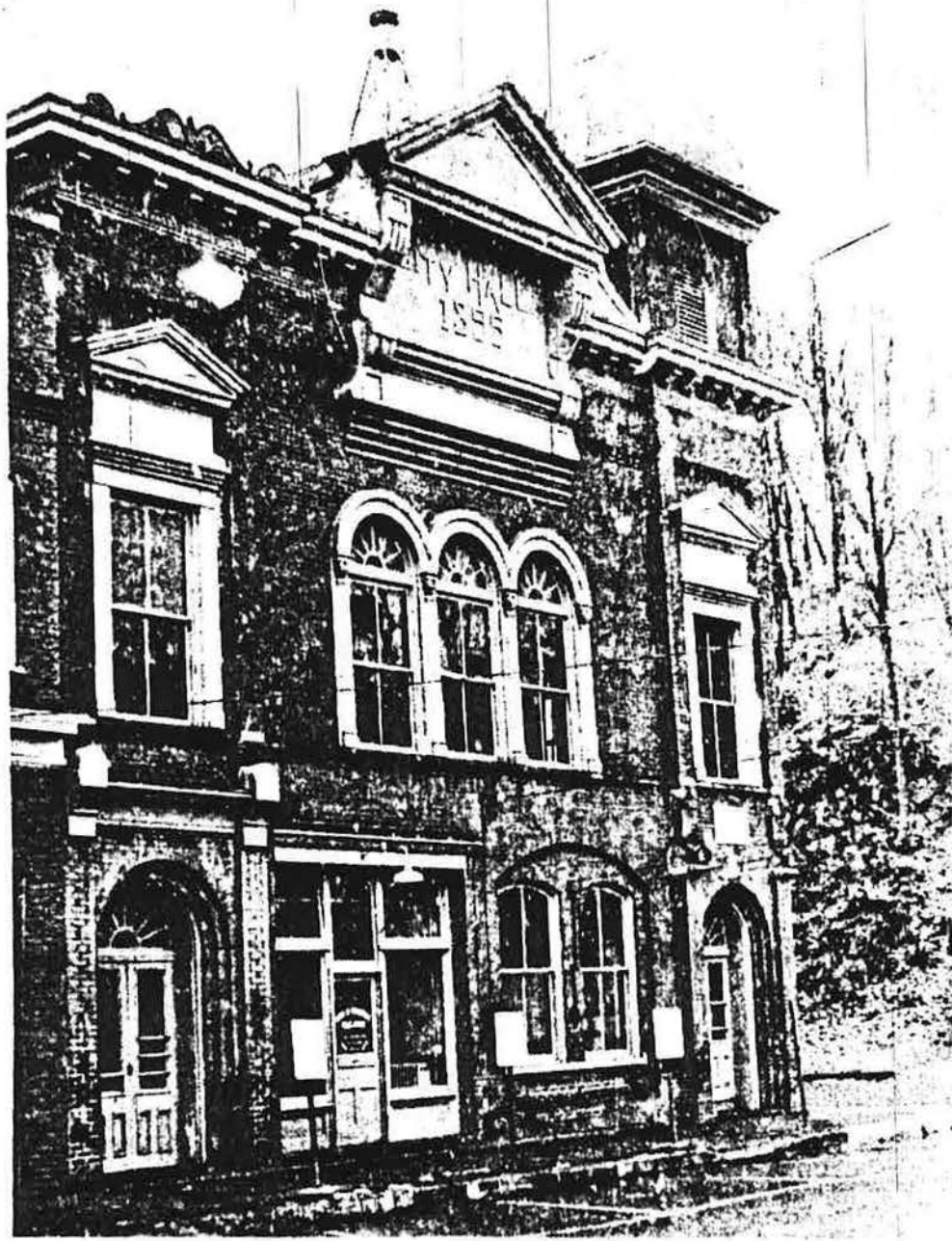
The Pocahontas Opera House and City Hall of 1895. Plays are presented at the Opera House during the summer season.