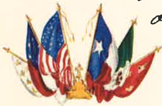
THE SIX FLAGS UNDER WHICH TEXAS HAS BEEN GOVERNED

We can stand a little cool weather now. I am going to try and catch up on my sleep tomorrow if possible.