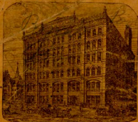
World's Dispensary, 650 to 670 Washington St., Buffalo, N. Y.

The above illustration represents the immense six-story building occupied exclusively for the manufacture of Dr. Pierce's Standard Maltiness , and known as the World's Dispensary . Within its walls are prepared a series of remedies of such exceeding merit that they have acquired a world-wide reputation and sale.