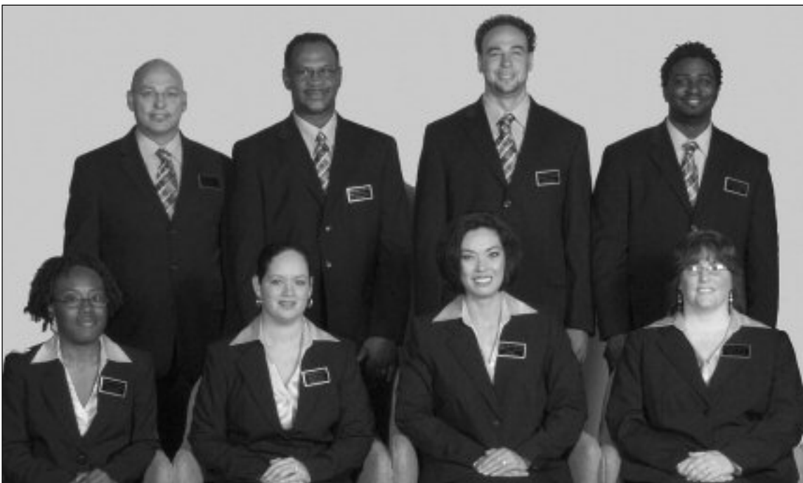
2007–08 FTCC Student Ambassadors

www.socon-line.org/publicpolicy/laws/ferpa.html ; cfco.ed.gov/fedreg.htm ; www.ed.gov/news.html ; or www.accessreports.com/statutes/FERPA.htm .