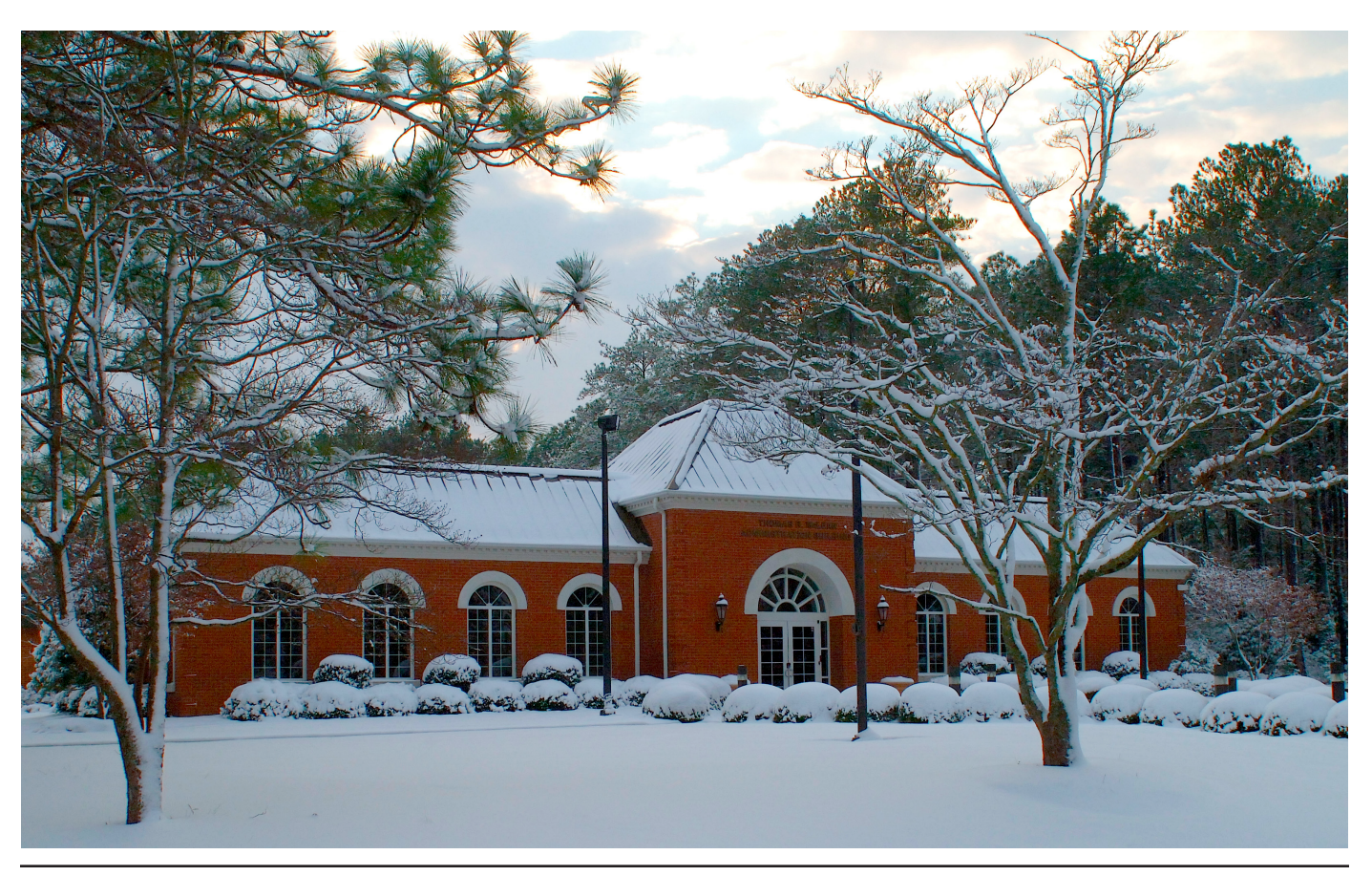
Refer to the FTCC website for the most current information. Go to www.faytechcc.edu and click on Academics.

Curriculum students are to log into their Blackboard sites for class assignments.