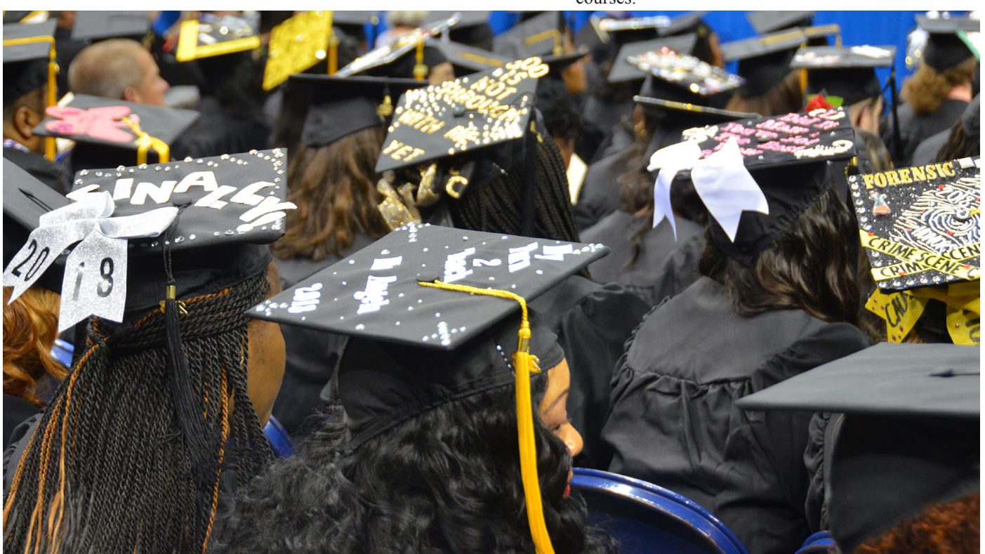
Refer to the FTCC website for the most current information. Go to www.faytechcc.edu and click on Academics.