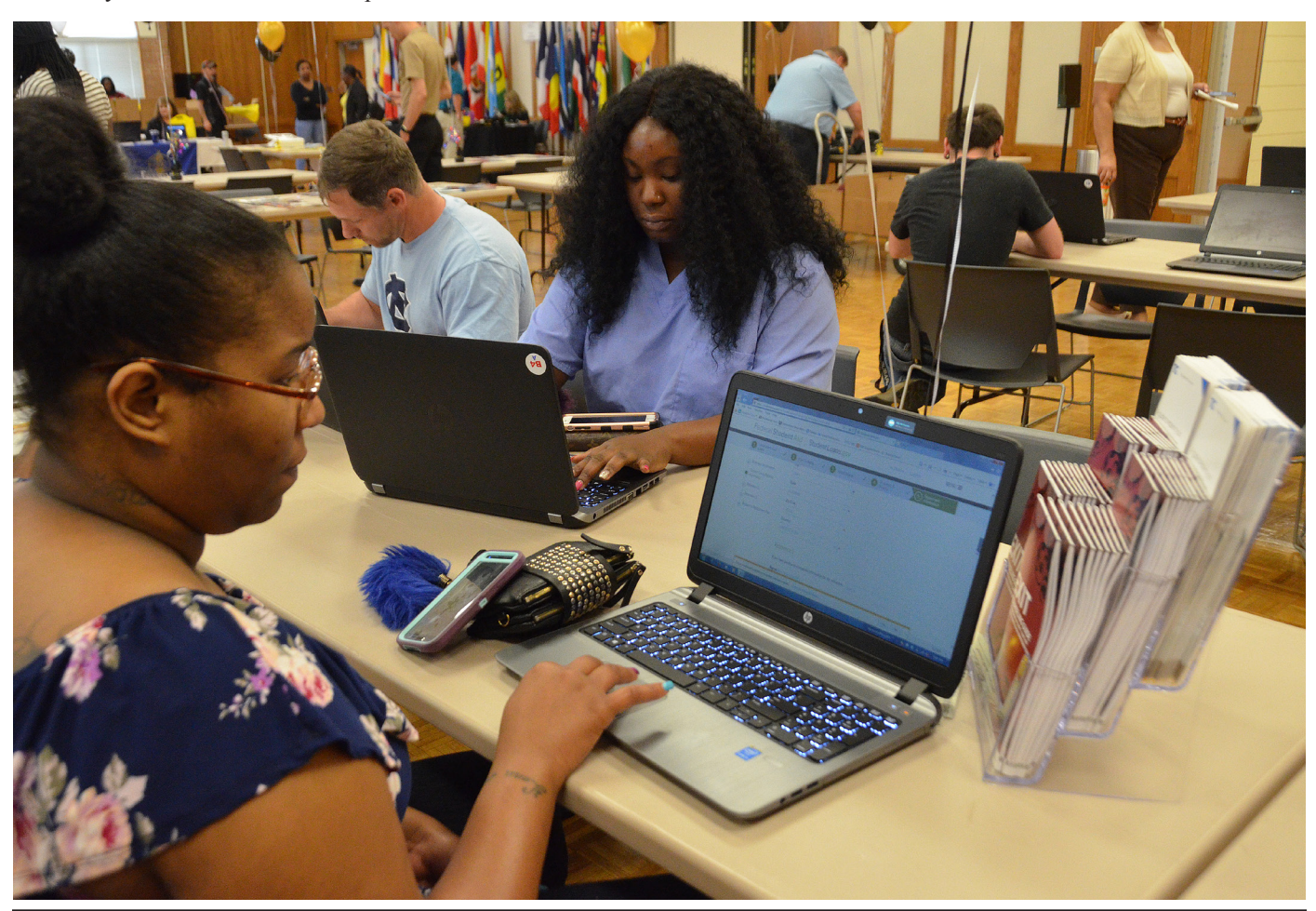
Refer to the FTCC website for the most current information. Go to www.faytechcc.edu and click on Academics.