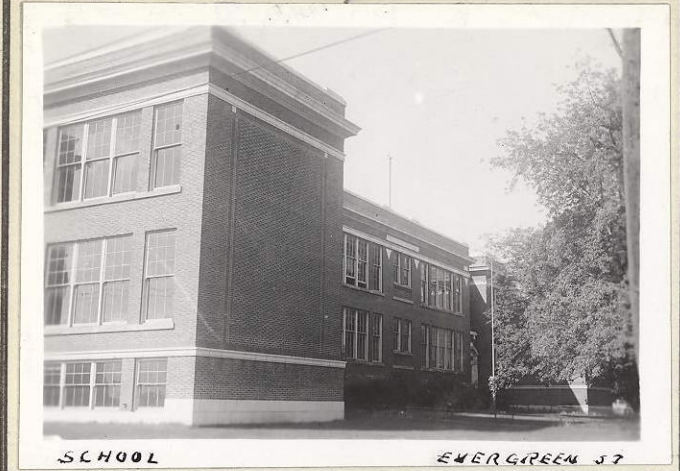
SCHOOL EVERGREEN ST

ADDRESS EXEMPT 3 9 4-383 WARD BOOK NO. PAGE NO. DISTRICT NO.