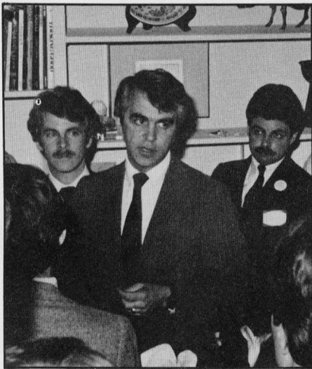
Boston Gay Community Reception honoring Senator Tsongas

“Paul Tsongas is intellectually honest, committed to social and economic justice and willing to explore new ideas. He is genuinely disgusted by people who pander to what the public wants irrespective of whether it’s right or wrong.”