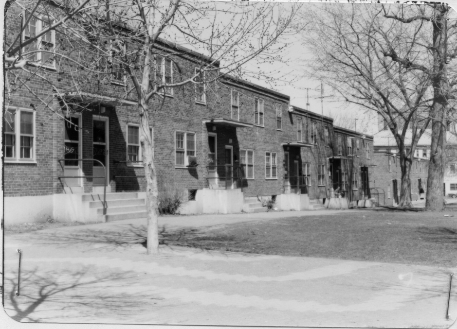
NORTH COMMON HOUSING PROJECT