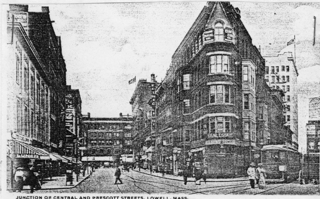
JUNCTION OF CENTRAL AND PRESCOTT STREETS, LOWELL, MASS.

A brick structure only partially covers the site; the park area, now paved, might yield foundation remains of the nineteenth century brick buildings.