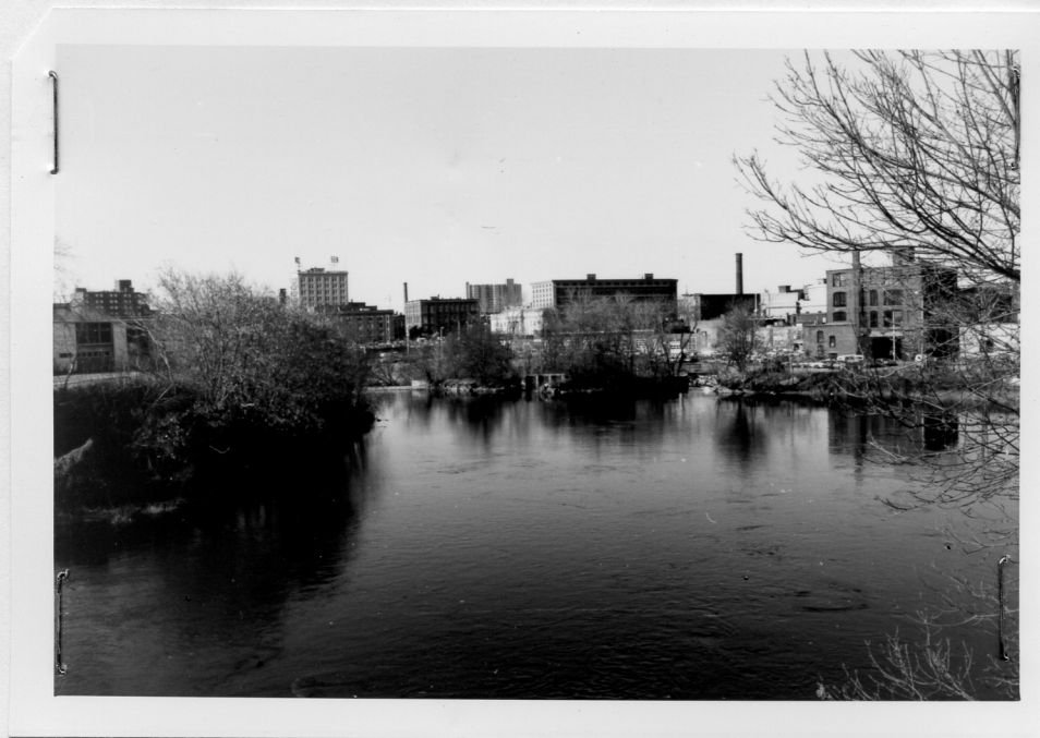
View from the southeast of the Belvidere site, from the Church Street Bridge.

The most notable features of this property are located in its southern half, along the riverbank. The concrete Middlesex Company dam crosses the Concord River in this area, ponding the river to the south.