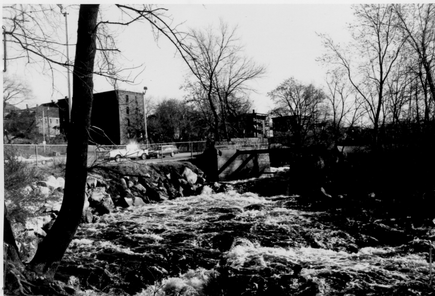
View from the northwest of the spillway. The Belvidere site is to the left, island to the right.