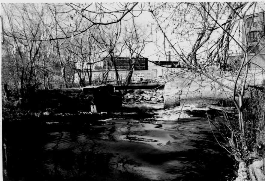
View from the southeast of the spillway separating the Belvidere site (right) from the island at the east end of the Middlesex Company dam.

east bank. The island is separated from that shore by a narrow spillway between concrete abutments, spanned by I-beams.