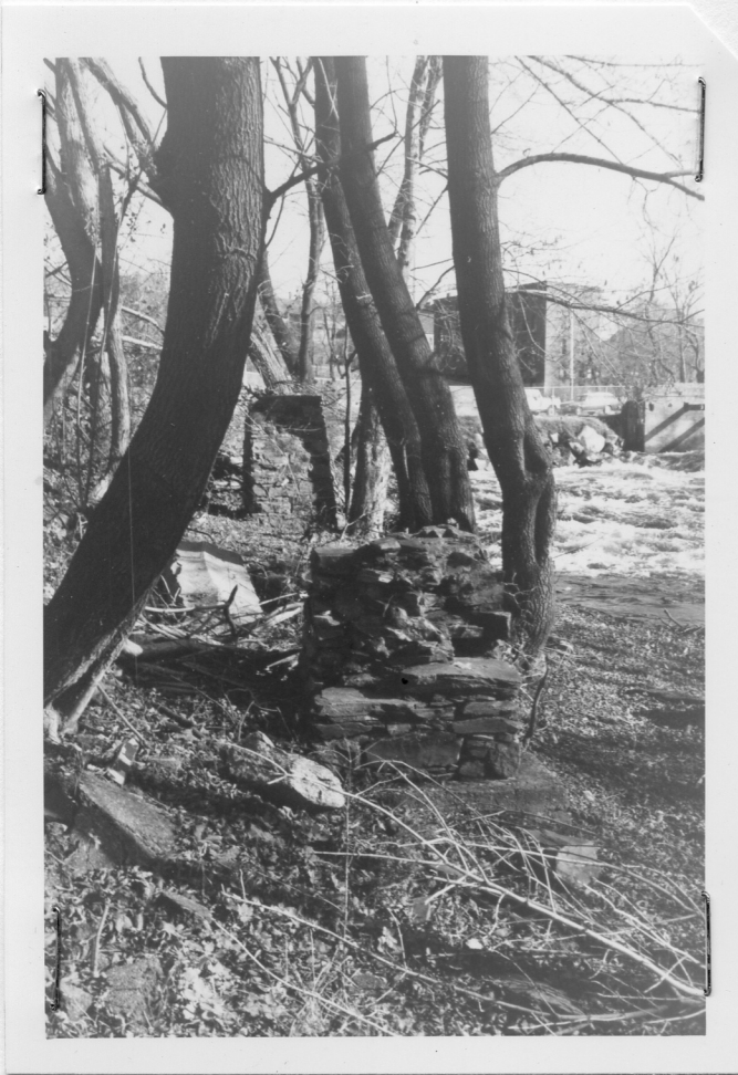
Two rubble stone abutments on the Concord riverbank at the Belvidere site.

That island and the riverbank north and south of it contain numerous walls, footings, and abutments of granite, concrete, and rubble stone related to the mills which operated on this site and to their waterpower systems.