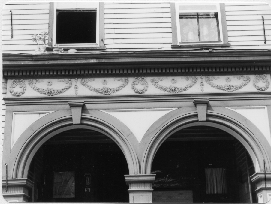
Detail of Doorway