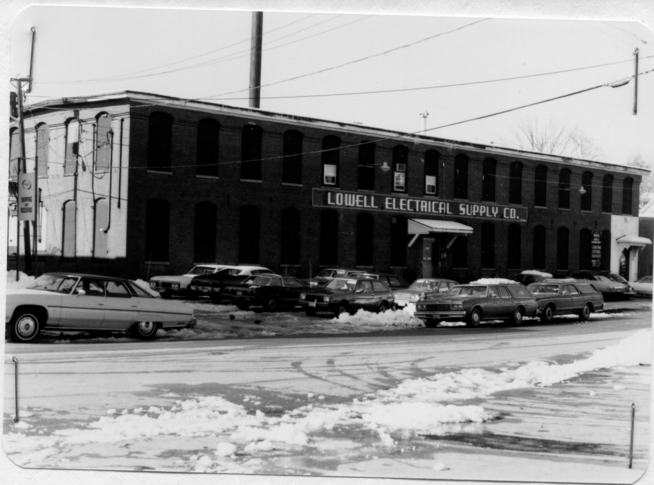
LOWELL HOSIERY CO.