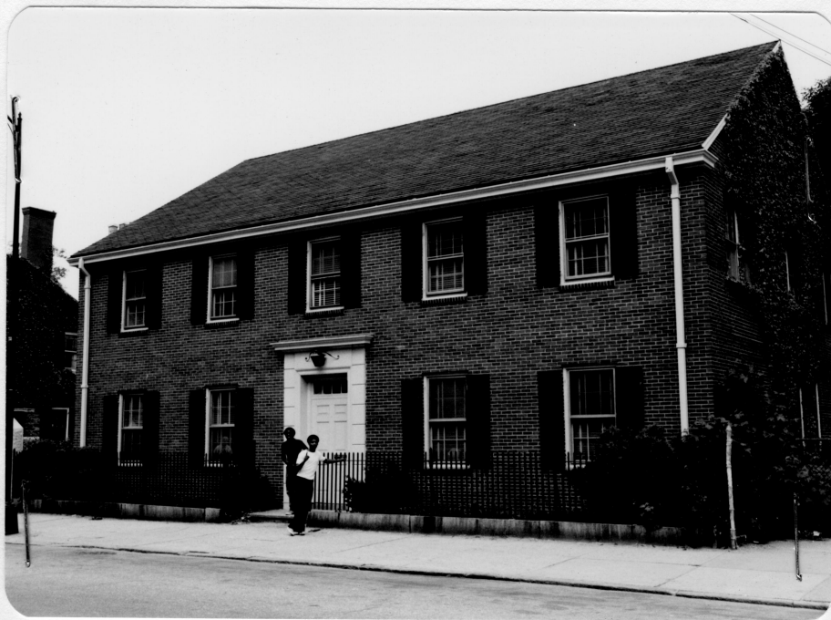
View from east of modern addition to St. Anne's Hall. Photograph taken by SBRA, May, 1979.