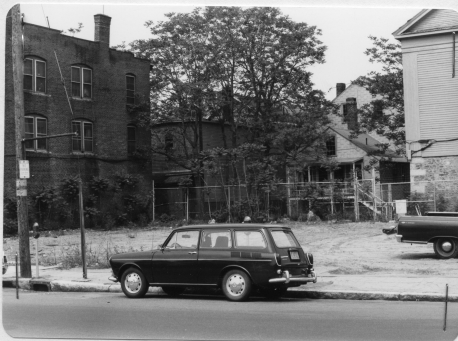
View from: east Photo taken: May 1979

The open lot beside Haffner's must contain remains of the Northern Temperance Institute and the two other late nineteenth century buildings removed from that site. These buildings probably destroyed any remains of the original structures on the property.