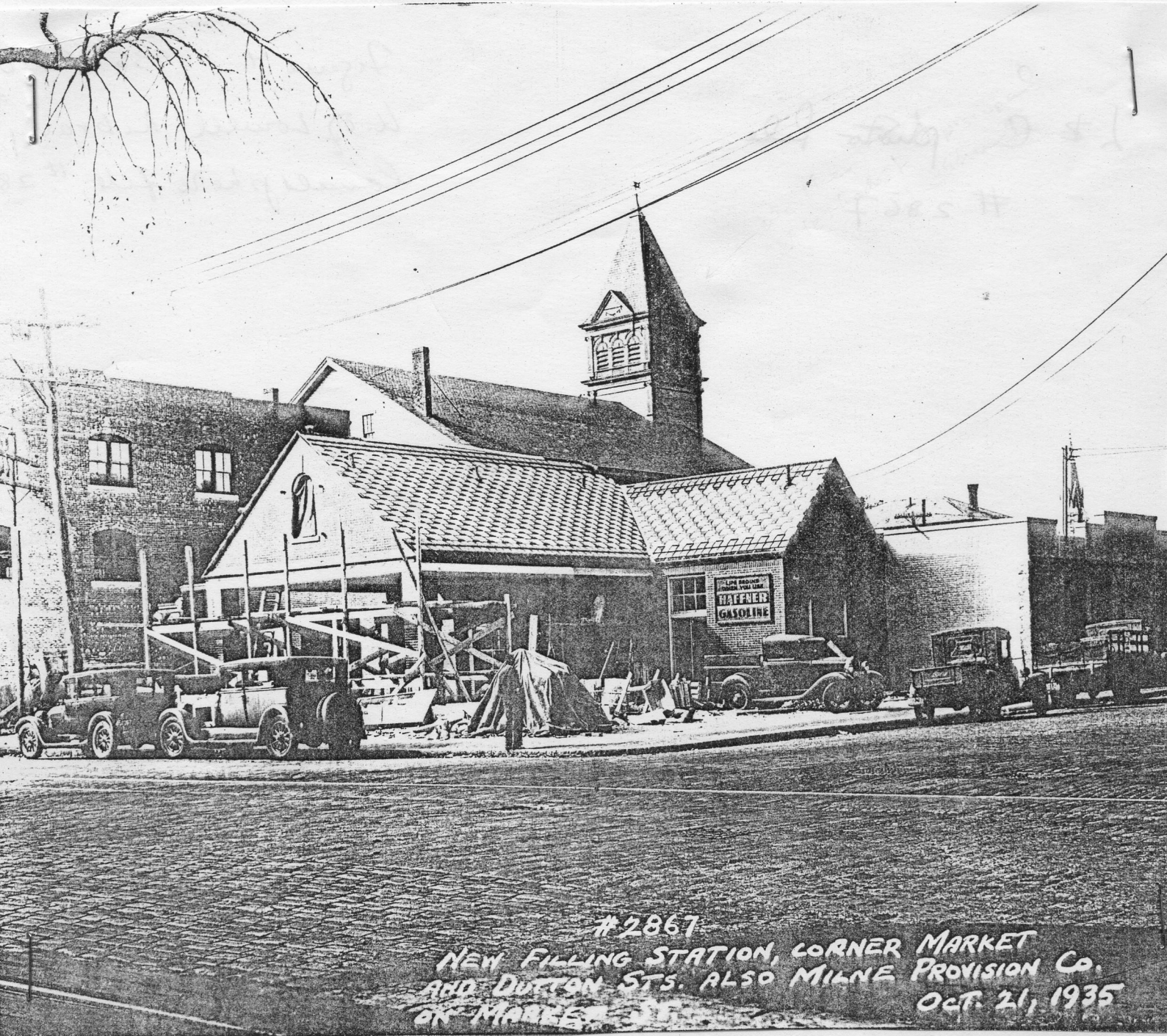
View of Haffner's with original canopy, 1935.