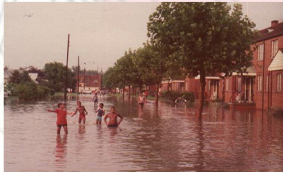
Riverview Flooding, 1968