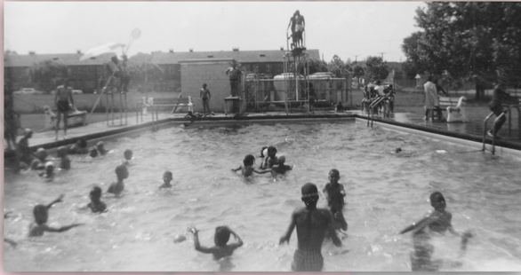
Riverview Swimming Pool, 1962

Despite the environment, Riverview residents were busy building their new neighborhood up during the forties and fifties. In November 1941, Central Baptist Church began services in their new Riverview church building, & that same year the Riverview Day Nursery opened. In 1951, Douglass School moved to Riverview from its former location near Bristol Blvd & Walnut Street. In 1953, the Riverview Swimming Pool Committee began fundraising to build a public pool in the neighborhood. On August 4, 1954, the Riverview Swimming Pool opened to the public.