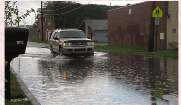
Riverview Flooding, 2012