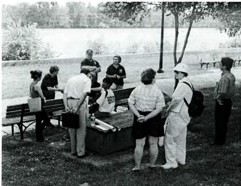
The first planning committee of the Southeast Asian Water Festival in 1997.

Fleet is a registered mark of FleetBoston Financial Corporation. ©2000 All rights reserved.