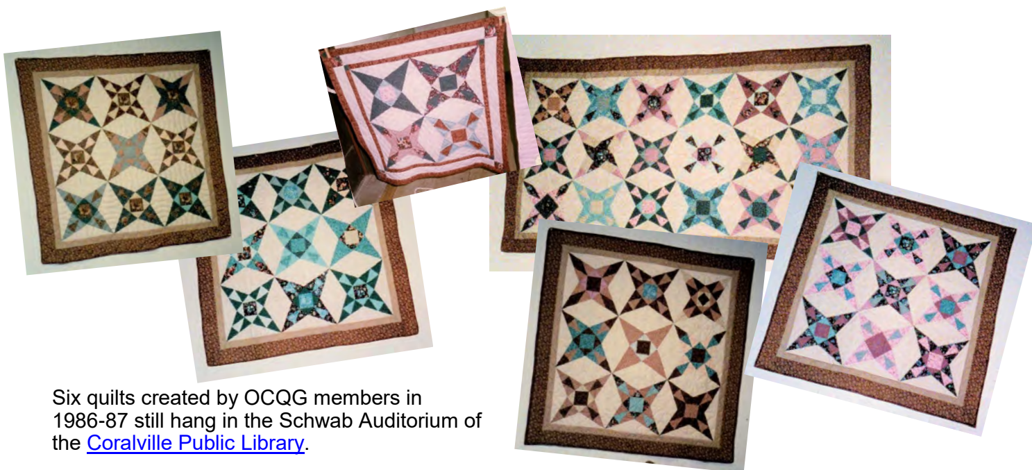
Six quilts created by OCQG members in 1986-87 still hang in the Schwab Auditorium of the Coralville Public Library .