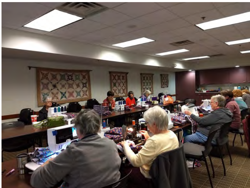
Days for Girls session in January 2019 held in the Schwab Auditorium with several of the OCQG Coralville Star quilts visible on the wall.