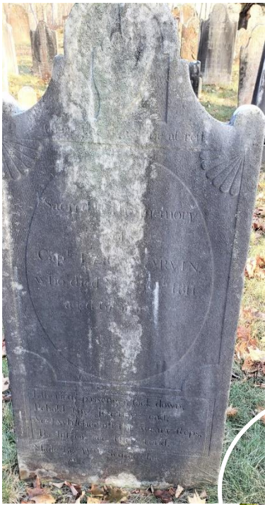
Capt. Ezra Marvin 1811 – age 67

Woodlands and Northeast cemeteries have no footstones that we know of. Main Road has an astounding number of them and they are very historically significant. Here are several examples of the footstones in Main Rd Cemetery.