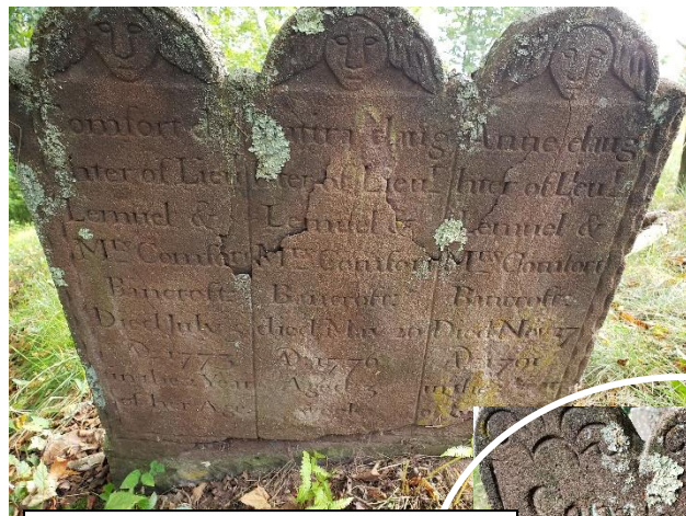
Comfort Bancroft - 1773 - age 2 Statira Bancroft - 1776 - age 3 wks Anne Bancroft - 1791 - age 2