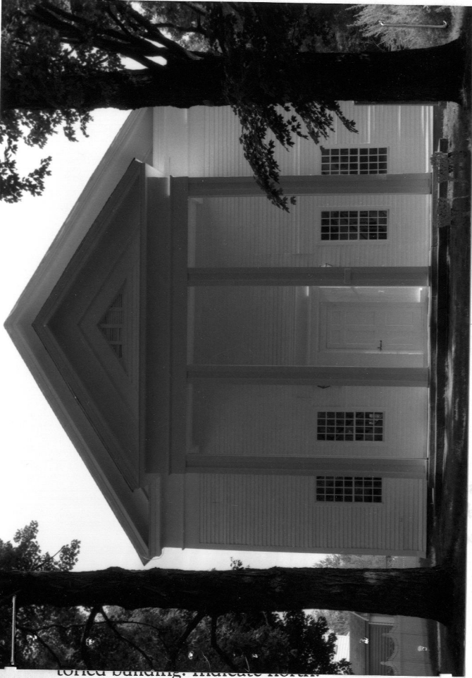
toried building. indicate location