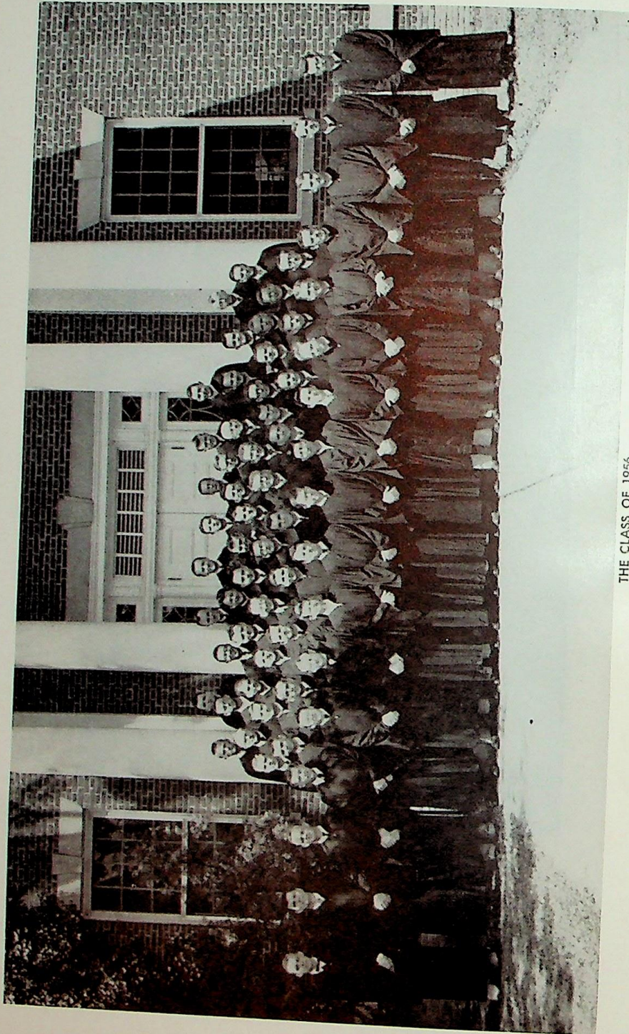
THE CLASS OF 1956