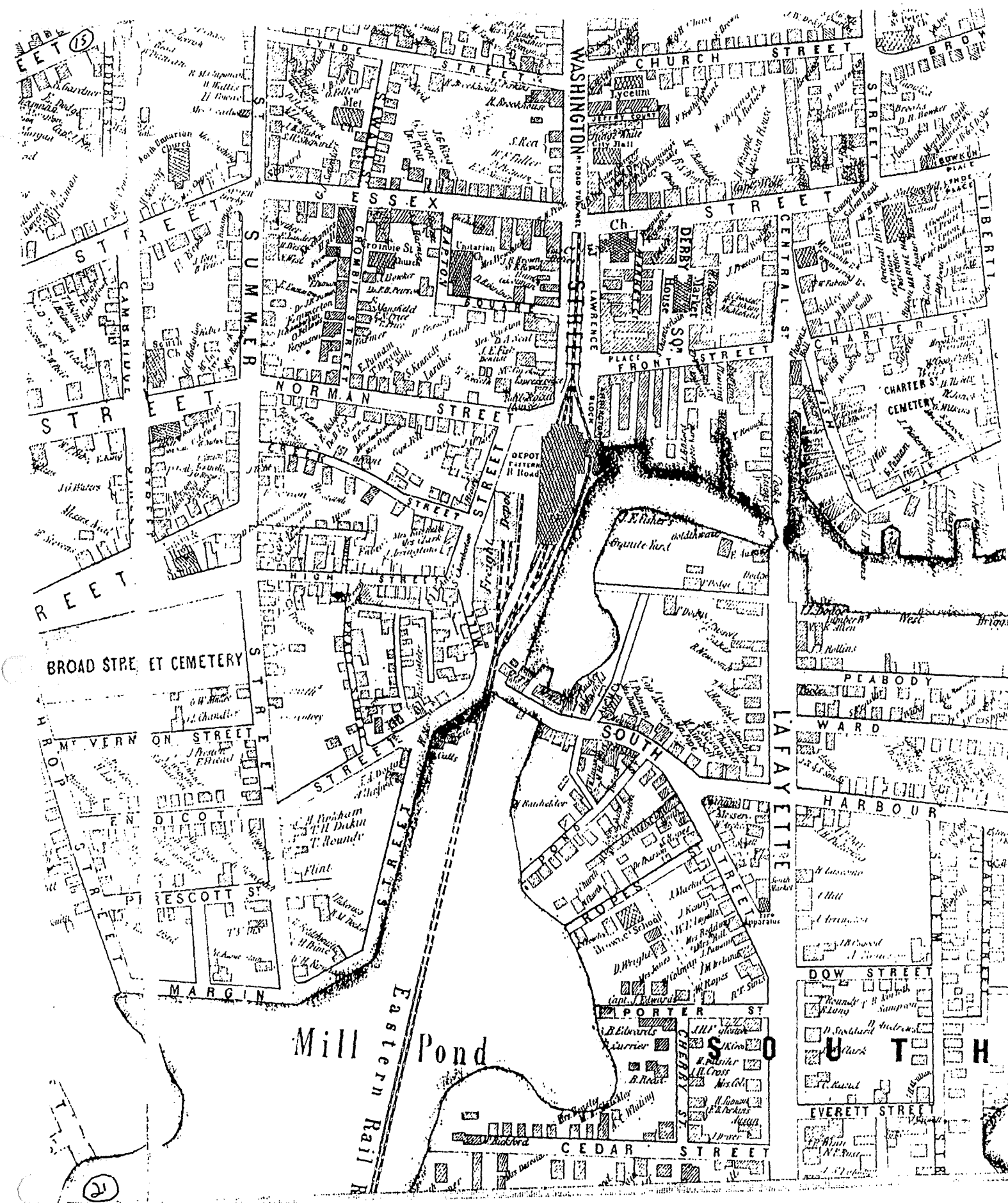
1851 Atlas of Salem