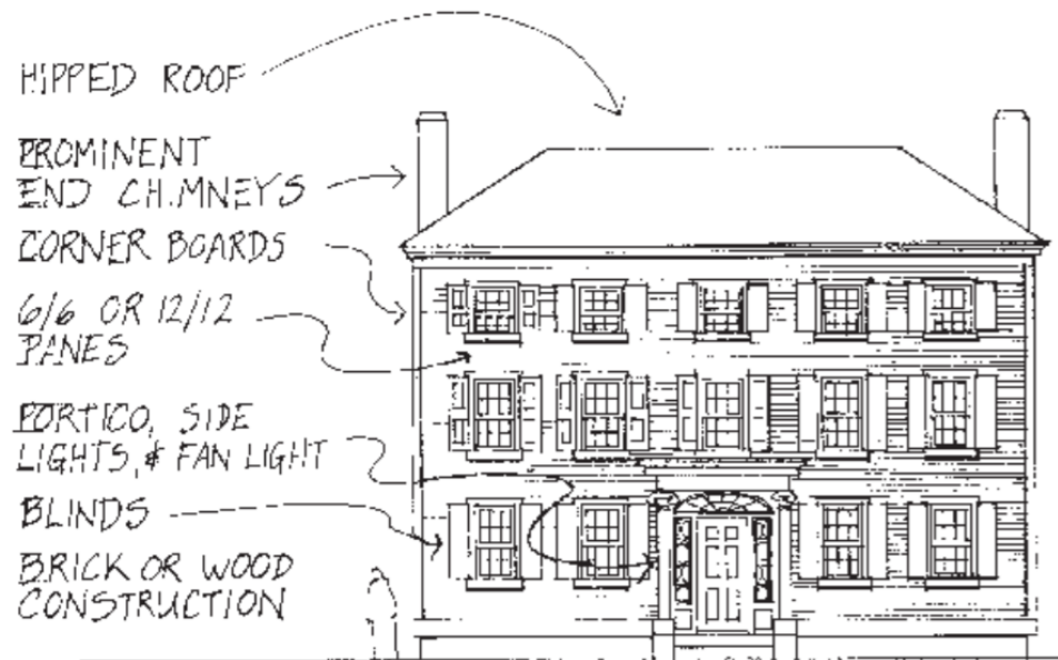
Common elements of Federal architecture, from "Architecture in Salem: A Guide to Four Centuries of Design." National Park Service, Salem Maritime National Historic Site.

The house at 22-24 Pleasant Street was constructed sometime between 1801 1 and 1807 for Benjamin Webb, yeoman and innholder. 2 Benjamin Webb purchased the lot of land from Pelatiah Brown in 1801 for $350. 3 The house is a fine example of the early 19th century's popular Federal style. While two-story gable roofed Federal period homes are common in Salem, three-story examples, such as 22-24 Pleasant Street, are not seen as often. 4 Pleasant Street was laid out in 1796, and extended to Bridge Street, meaning that 22-24 Pleasant Street was likely one of the first houses constructed on the street. 5 Prior to the house being re-numbered as "22-24 Pleasant Street," it was considered to be "31 Pleasant Street."