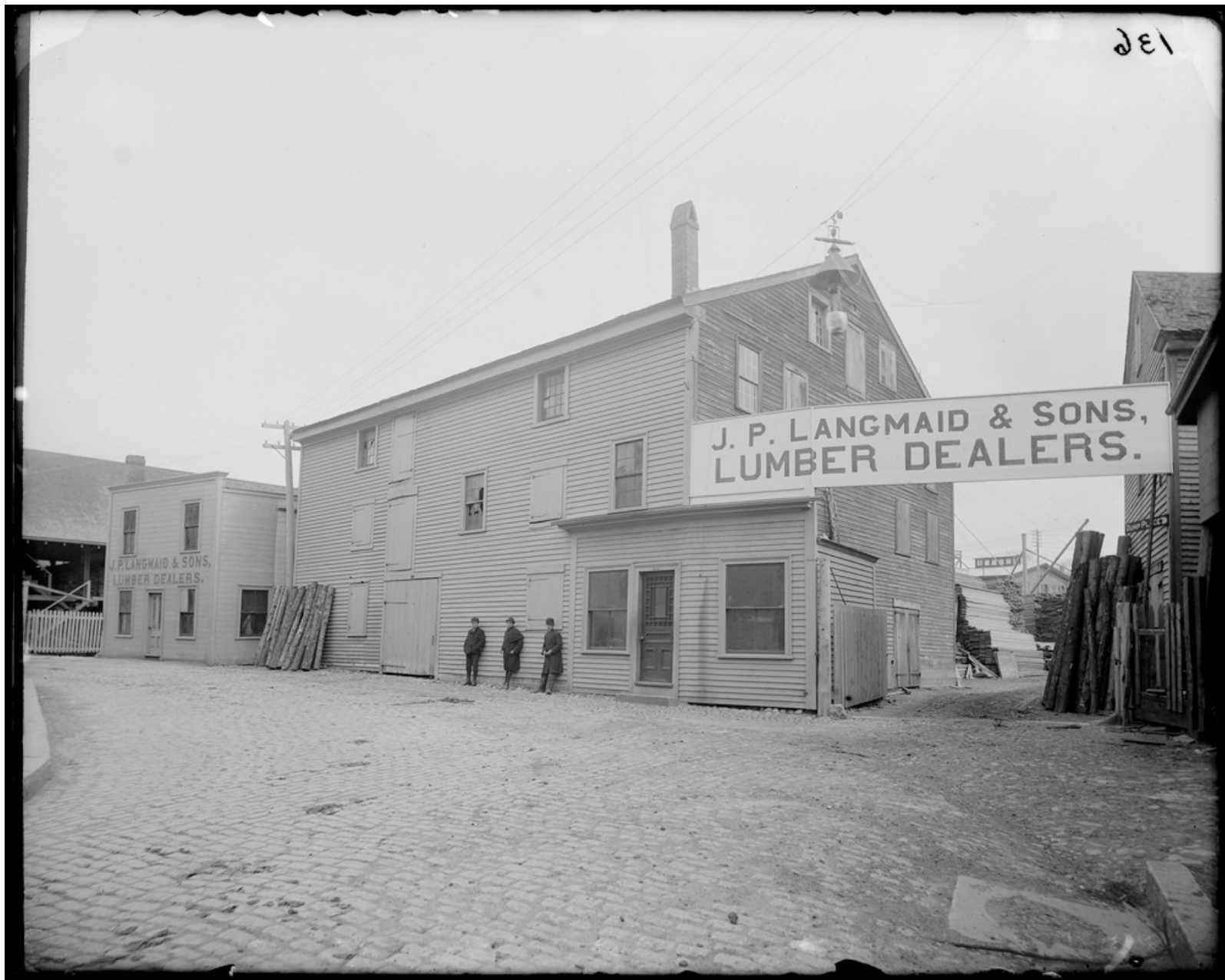
Cousins, Frank. "Salem, 205 Derby Street, store of William Gray, 1790." Photograph. 1865. Digital Commonwealth