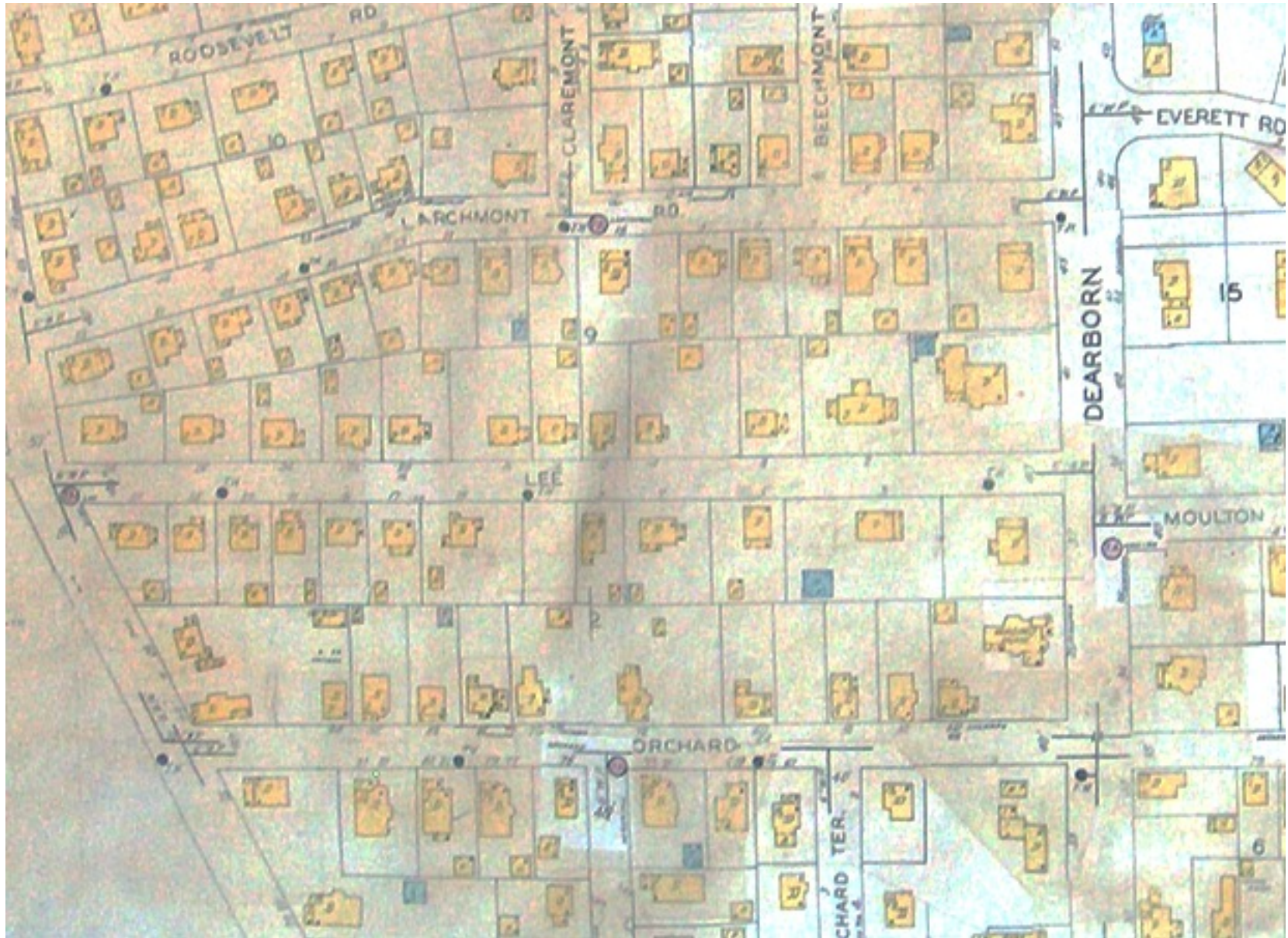
1932 Atlas Map