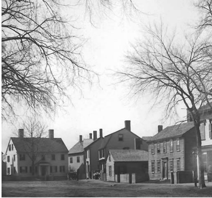
View of the north end of Broad Street prior to 1914 fire