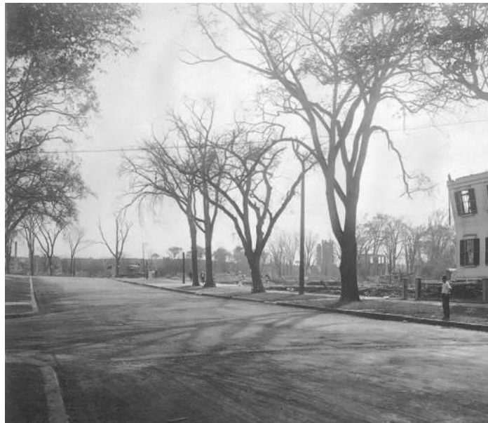
View of the same area of Broad Street post 1914 fire 11